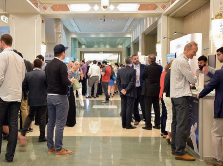
Almost 20 international companies exhibited their latest endodontic products.

ever, it became easier to communicate thanks to the high quantity of visual information.