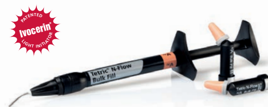
Tetric® N-Flow Bulk Fill flowable