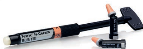
Tetric® N-Ceram Bulk Fill sculptable

* Compared with Tetric® N-Flow and Tetric® N-Ceram. Data available on request.