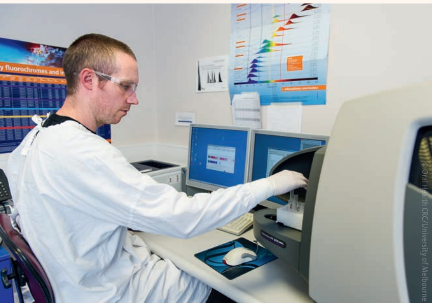
Flow cytometry is used to measure changing levels of oral bacteria.

gingivalis gingipain vaccine induces neutralising IgG1 antibodies that protect against experimental periodontitis".