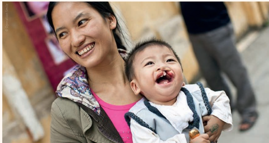
For their child affected by cleft lip and/or palate, more than 80 per cent of Vietnamese families surveyed in a study sought surgical care in a charitable mission—although 73 per cent of them had health insurance.

understood in order to design more effective programmes for both missions-based and locally sustainable surgical care in LMICs. On the basis of their findings, they proposed a new surgical LMIC