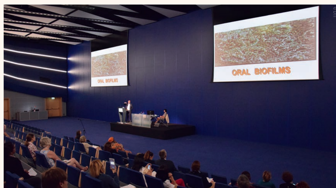
Prof. Denis Bourgeois spoke about the role of interdental biofilm management in his presentation in Poland.

By measuring the interproximal space correctly, Bourgeois and his team concluded that the latest generation of interdental brushes was able to access 94 per cent of interdental spaces. Over 80 per cent of the sites required a small-diameter interdental brush (0.6 to 0.7 mm) of the Curaprox CPS Prime Series, and differences occurred between anterior and posterior sites. Participants were able to use the interdental brush easily following instructions. As a result, most interdental sites can be cleaned using interdental brushes, but accessibility of interdental spaces would need to be established in the dental practice with the use of the CURAPROX IAP Probe. More information can be found at www.curaprox.com .