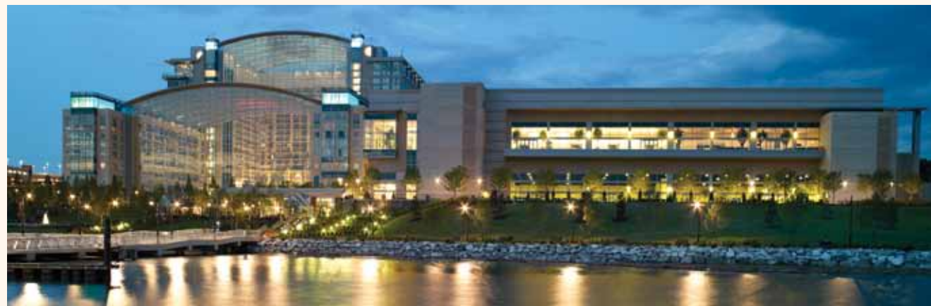
The Gaylord National Resort & Conference Center in National Harbor, Md., with its 18-story-tall climate-controlled atrium of glass and steel, is host site of the American Academy of Cosmetic Dentistry 28th Annual Scientific Session.