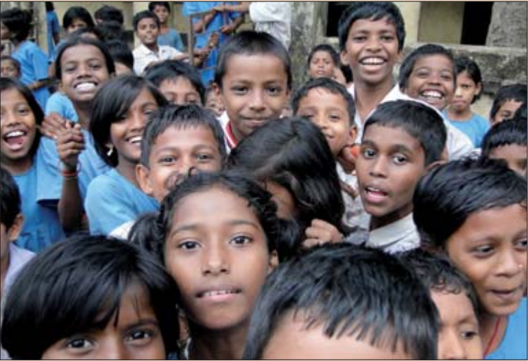
A group of Indian schoolchildren in Puri.

The figures confirm warnings by dentists from the Kothiwal Dental College and Research Centre in Uttar Pradesh that traumatic dental injuries (TDJ) could pose