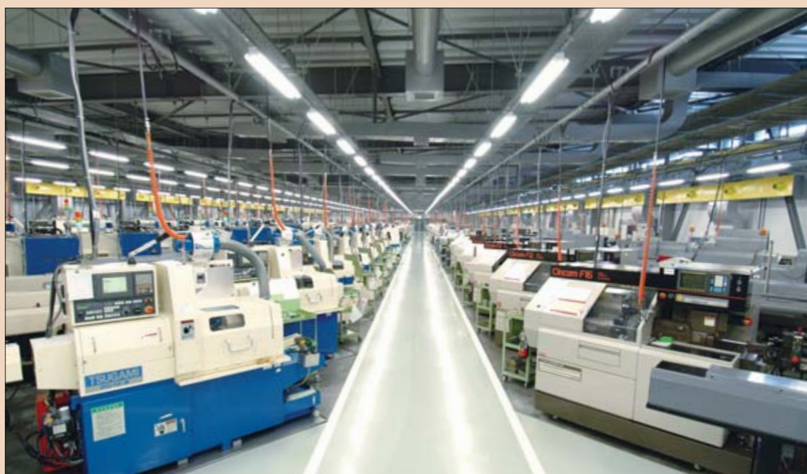
Picture showing production facilities with more than 100 Computerised Numerical Control machines.

Rounding out the commitment to quality assurance, pricing options and responsiveness is awareness that the ultimate customer is the patient. "I am a strong believer in the need to be aware that we are a medical device company, and that with that comes a huge responsibility, not just in terms of quality, but also comfort and safety of the patient," Stiehle told Dental Tribune . "When I am sitting in the dentist's chair, I want to make sure that I am worked on with the best product out there. That's what is most important to us: the safety and comfort of the patient." ■