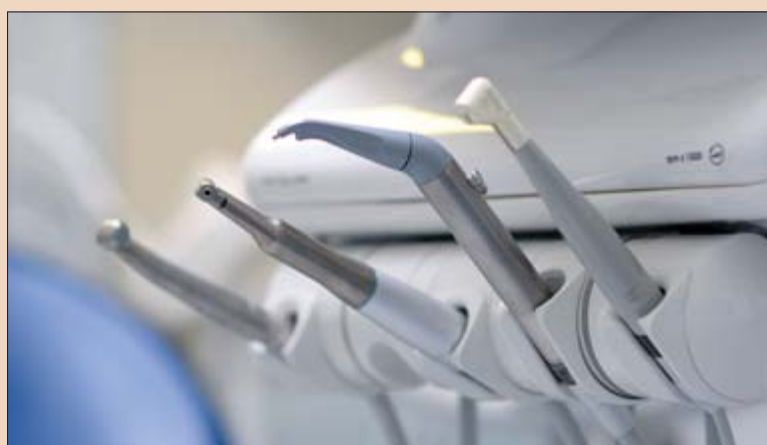
White Smile Orthodontic is the third dental acquisition of Q&M in Malaysia.

The practice currently offers orthodontic treatment and other procedures like tooth-whitening. On its website, it claims to be the first to have offered lingual braces treatment in Malaysia.