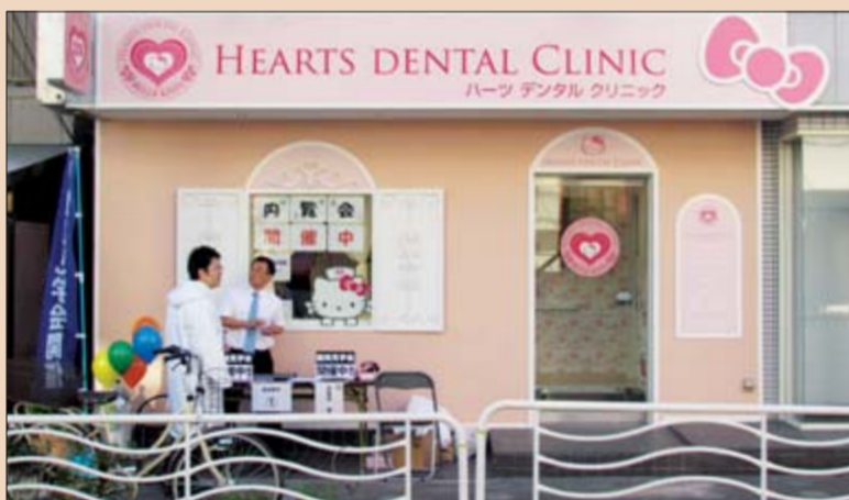
Tokyo's latest attraction is a dental clinic fully branded with the well-known Hello Kitty trademark. ► ASIA NEWS, page 3

Established in 2006, the IIUM's Faculty of Dentistry currently offers five-year Bachelor of Dental Surgery programmes. According to its website, 234 students are currently enrolled in the faculty, which makes it one of the largest dental institutions nationwide alongside the Universiti Sains Malaysia's School of Dental Sciences in Kubang Kerian and Penang International Dental College in Petaling Jaya. [1]