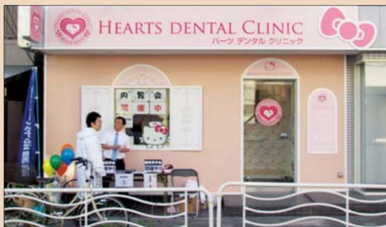
Tokyo's latest attraction is a dental clinic fully branded with the well-known Hello Kitty trademark. ► ASIA NEWS, page 3

Established in 2006, the IIUM's Faculty of Dentistry currently offers five-year Bachelor of Dental Surgery programmes. According to its website, 234 students are currently enrolled in the faculty, which makes it one of the largest dental institutions nationwide alongside the Universiti Sains Malaysia's School of Dental Sciences in Kubang Kerian and Penang International Dental College in Petaling Jaya. [1]