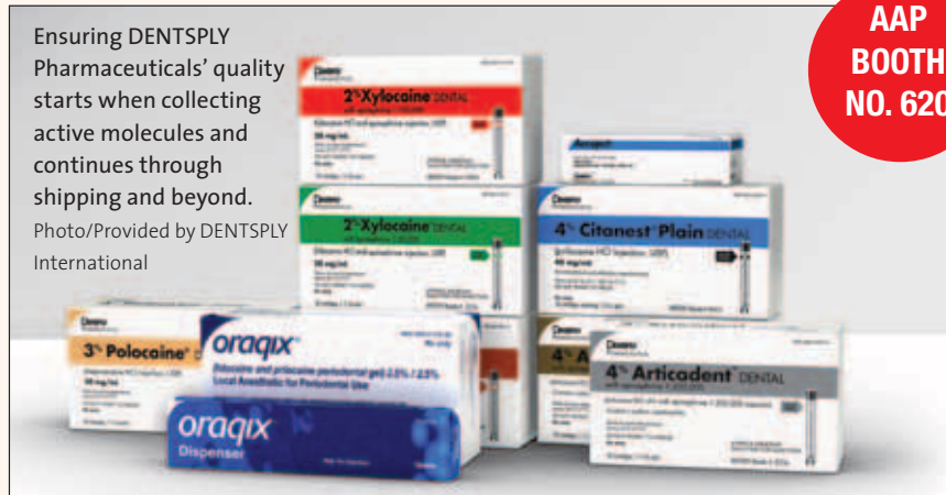
Ensuring DENTSPLY Pharmaceuticals' quality starts when collecting active molecules and continues through shipping and beyond.