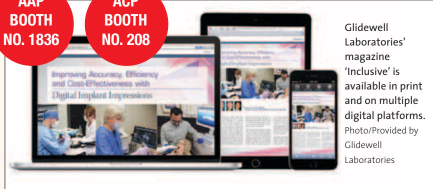
Glidewell Laboratories' magazine 'Inclusive' is available in print and on multiple digital platforms.

used to access and graft a facial bone defect adjacent to an anterior extraction site.