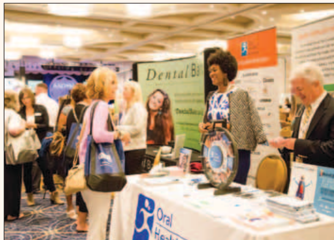
Up to 800 attendees and 100 exhibiting companies are expected at AADOM's 12th annual session, Sept. 15–18, at the Boca Raton Resort & Club in Boca Raton, Fla. You can learn more online at www.aadomconference.com.

ner of the 2016 Practice Manager of the Year, as well as induct the newest class of fellows into the AADOM Fellowship Program. AADOM is once again hosting the Dental Spouse Business Network (DSBN) for dental spouses and life