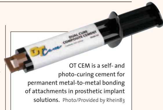
OT CEM is a self- and photo-curing cement for permanent metal-to-metal bonding of attachments in prosthetic implant solutions.