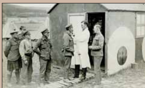
WWI Canadian dentist outside his hut attends to patients in the field.

Created in partnership with the Royal Canadian Dental Corps, the exhibition will highlight clinical, technological and humanitarian developments in Canadian military dentistry as the corps marks its centennial. Whether working in the field, conducting forensic work following a disaster or conflict or helping other countries to build the capacity to handle dental health needs, the corps has been an integral part of the Canadian military experience.