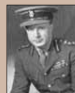
Pte. Charles Bryce Climo, Canadian Expeditionary Force, 1916–1919, was awarded the distinguished conduct medal for bravery (second only to Victoria Cross for gallantry).