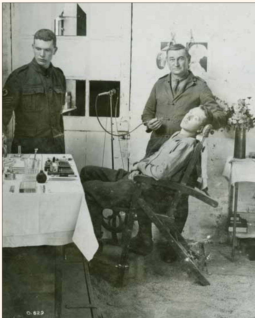
WWI Canadian Army Dental Corps dentist and patient, 3rd Canadian Field Ambulance Dressing Station, Vlamertinghe, Belgium. Today the service is the Royal Canadian Dental Corps.

In testament to the validity and efficacy of the well-oiled machine the corps became, a consultant with the British Army, Sir Cuthbert Wallace, said at the war’s end: “The Canadians had a very