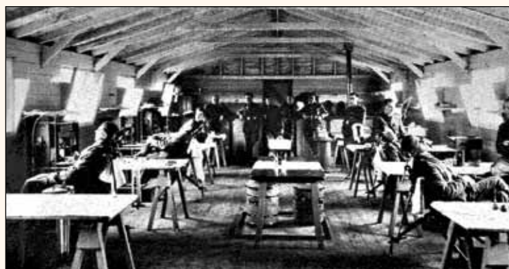
Top, World War I Canadian Army Dental Corps clinic in Bramshot, England, 1917/1918. Above, a typical field dental clinic operator. Makeup of the CADC at war's end: 233 dental officers, 223 NCOs and 238 privates.