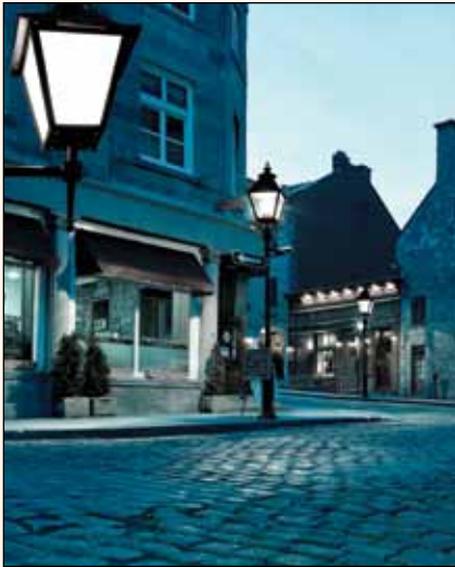
Saint-Paul Street in Old Montréal is one of many sights awaiting attendees of the 2015 Journées Dentaires Internationales du Québec from May 22–26.