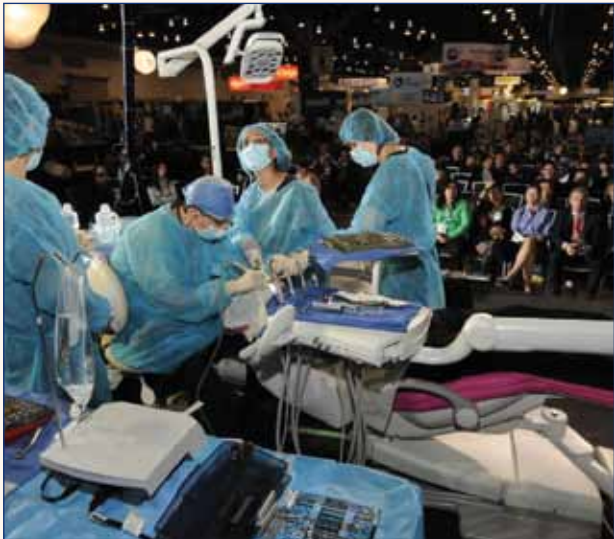
The Pacific Dental Conference exhibit hall's popular 'Live Dentistry Stage' (shown here at the 2014 conference) typically ends up being standing-room only for most sessions.