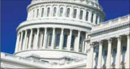
ADA 2015 is Nov. 5–8 in Washington, D.C.