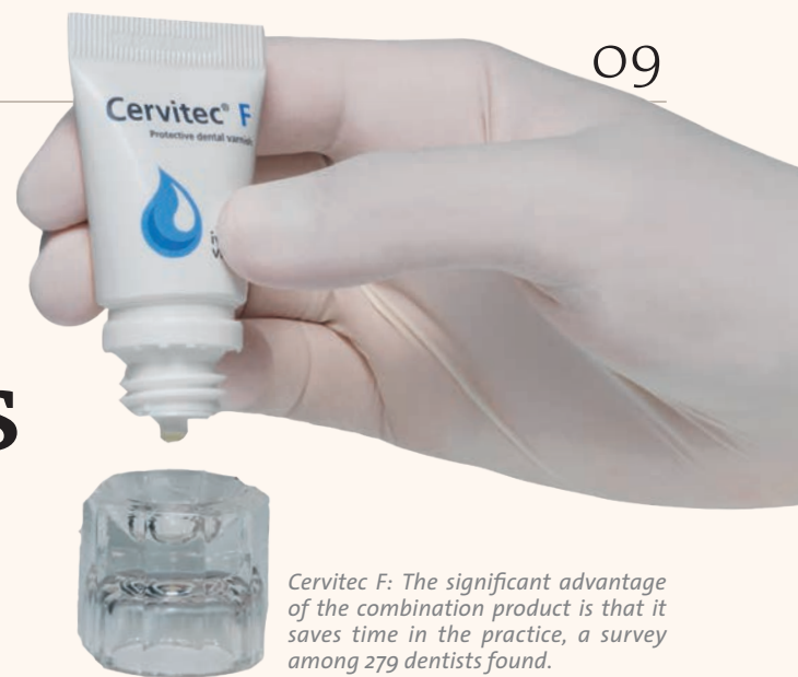
Cervitec F: The significant advantage of the combination product is that it saves time in the practice, a survey among 279 dentists found.

pany. This means that fluoride application and bacterial control can now be achieved in one working step, the representative explained.