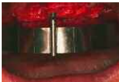
Fig. 5: Edentulous guide in place.