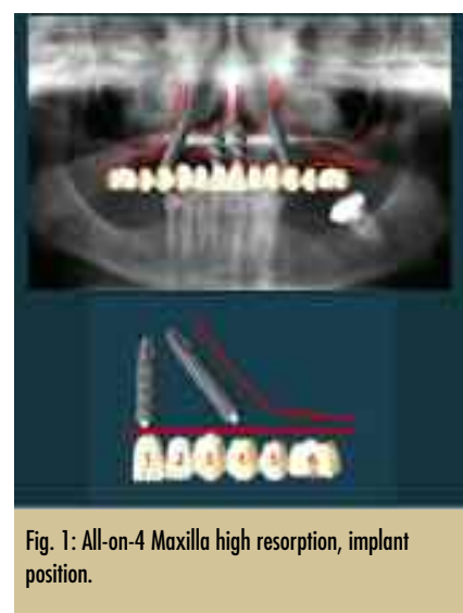
Fig. 1: All-on-4 Maxilla high resorption, implant position.

Based on these principles the All-on-4 concept was developed for safe and simple treatment of totally edentulous mandibles and maxillas and has been shown to be a viable option. The advantage of the All-on-4 for the edentulous mandible is it avoids the use of bone graft or nerve transposition techniques even in