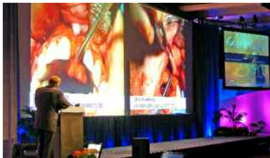
Two live surgeries are shown side-by-side at the AAID's annual meeting in San Diego on Oct. 31.

These were just a few of the glowing comments heard immediately following the first two live surgeries that took place the morning of Oct. 31 at the American Academy of Implant Dentistry's 57th Annual Meeting at the Manchester Grand