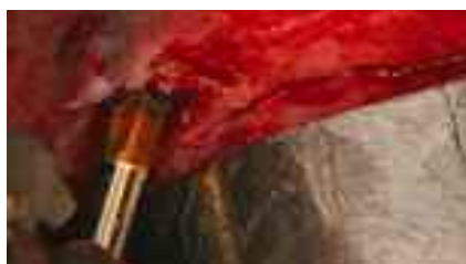
Fig. 6: Implant neck positioned at bone level with the desired distal angulation helped by the edentulous guide.