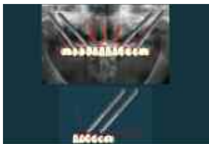
Fig. 4: All-on-4 Extra-Maxilla, implant position.