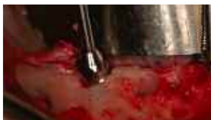
Fig. 7: Thirty-degree angulated abutment placed to compensate the distal implant tilting in the mandible.