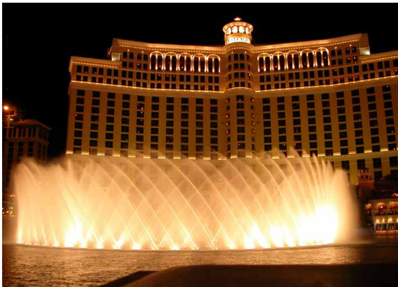
The ICOI's Spring Symposium will take place at the Bellagio Hotel in Las Vegas from May 16–18.