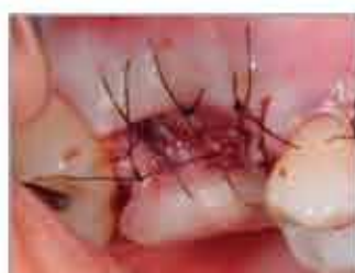
Sutured Without Primary Closure