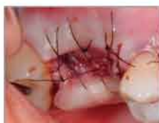
Sutured Without Primary Closure