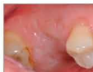
16 Week Post-Op Mature Tissue Closure