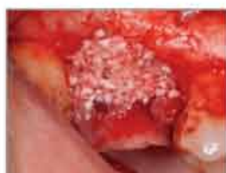
Grafted Extraction Socket