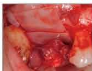
Renovix® Placed Double Layer