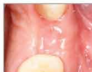
4 Week Post-Op Mature Tissue Closure