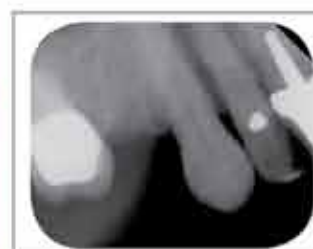
16 Week X-Ray Ideal Bone Formation