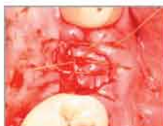
Sutured Without Primary Closure