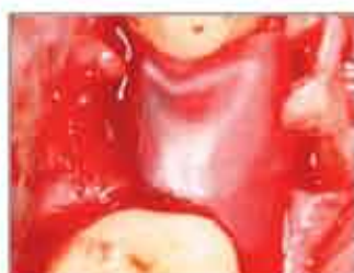
Renovix® Draped Over Surgical Site