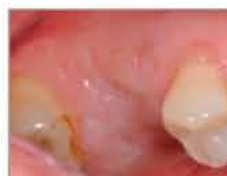
16 Week Post-Op Mature Tissue Closure