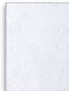
30mm x 40mm