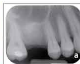
16 Week X-Ray Ideal Bone Formation