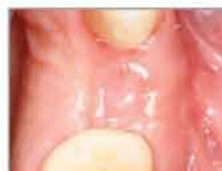
4 Week Post-Op Mature Tissue Closure