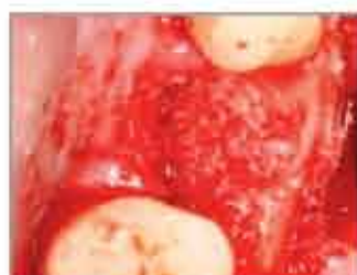
Grafted Extraction Socket