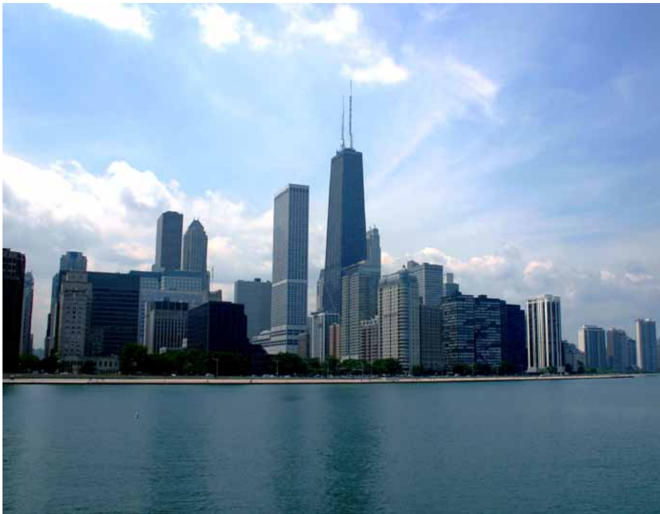
The ICOI's Summer Implant Prosthetic Symposium returns to Chicago in August.

This summer, the Implant Prosthetic Symposium returns to Chicago, and fall will bring another World Congress