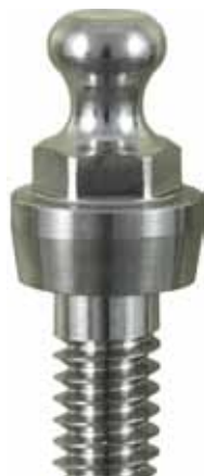
Sterngold Dental's new ORA, ball and o-ring attachment system.