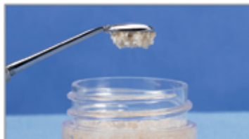
Exceptional Handling Characteristics