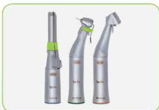
Surgical straight and contra-angle handpieces with or without Mini LED+