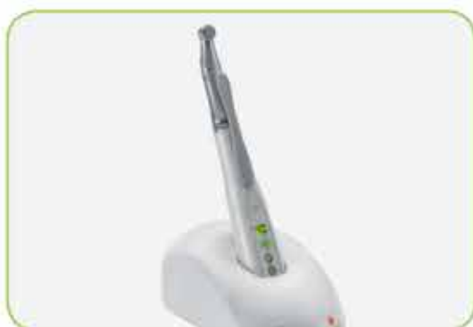
IA-400 Digital torque wrench