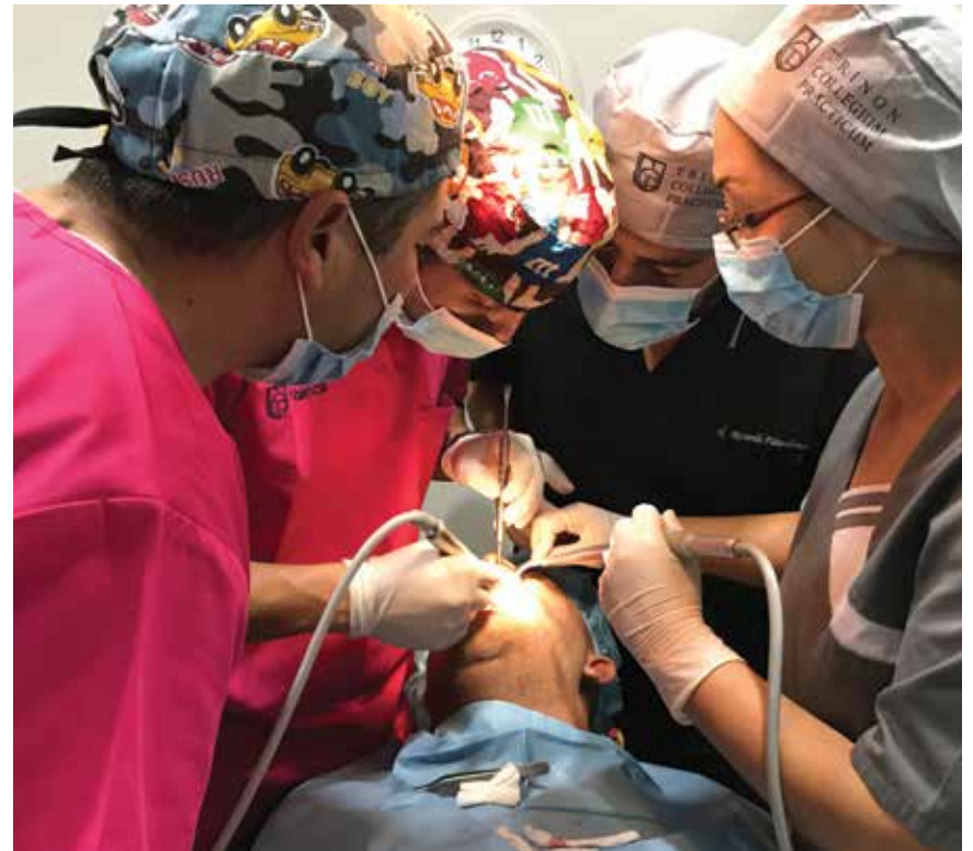
Earn 60 C.E. hours while gaining practical experience.

For more information on Trinon Collegium Practicum courses, call (877) 705-1002, e-mail register@implantologycourses.com or visit online at www.implantologycourses.com . You can also visit booth No. 2339 at the Chicago Midwinter Meeting to learn more about Trinon educational courses.