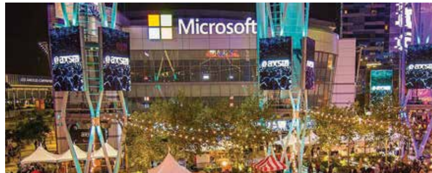
The AO President's Reception will take place in Microsoft Square in Los Angeles.

Microsoft Square is within the L.A. Live