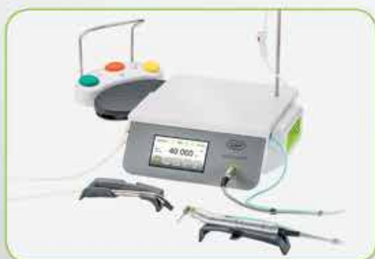
NEW Implantmed SI-1015 with wireless foot pedal option, Osstell ISO option and LED powered motor option