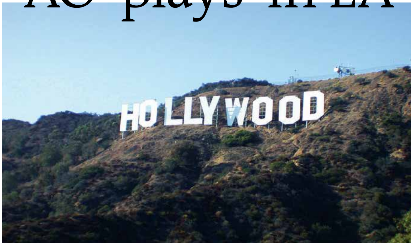
Los Angeles will be the site of the Academy of Osseointegration Annual Meeting from Feb. 28-March 3.