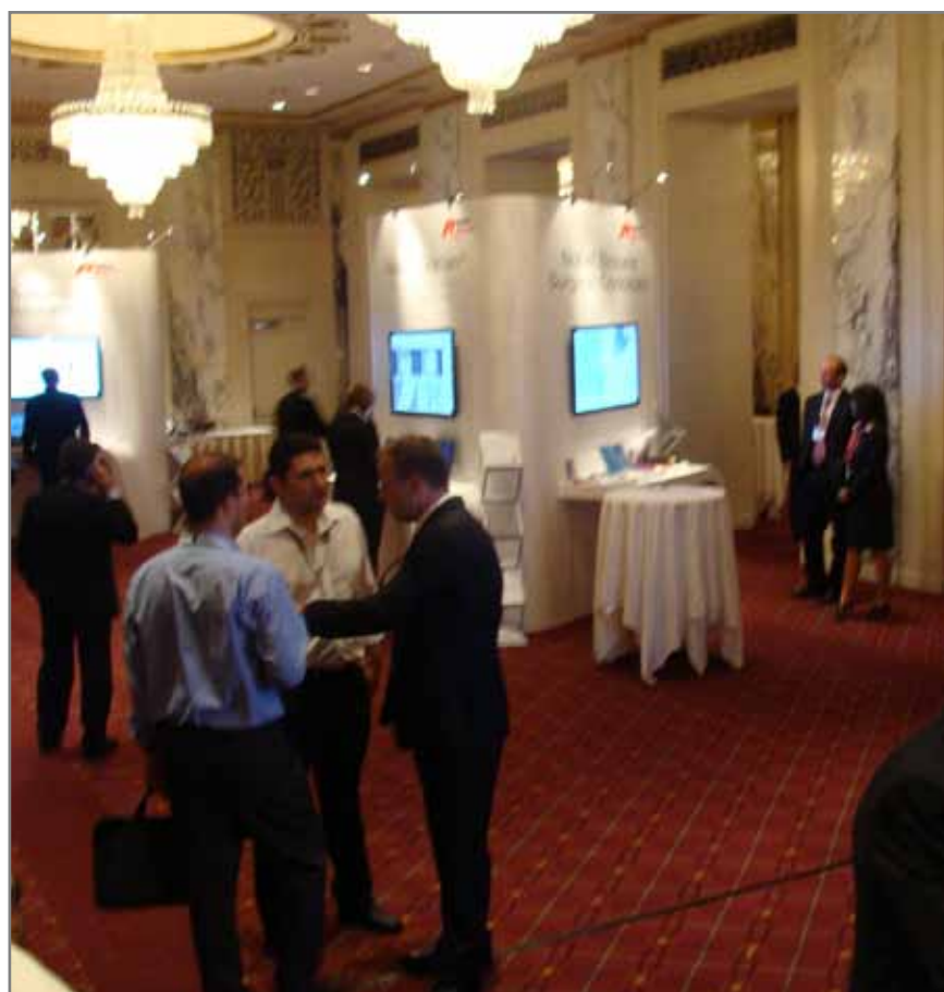
Between sessions, meeting attendees were able to take the opportunity to learn more about products.

The next Nobel Biocare Global Symposium will be held in August 2011 in Tokyo. IT