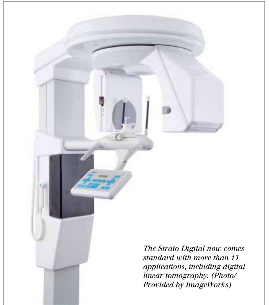
The Strato Digital now comes standard with more than 13 applications, including digital linear tomography.

For more dental news, see www.dental-tribune.com