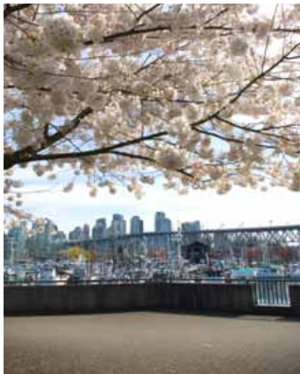
Vancouver is the site of the 2010 BIODENIX Implantology Forum.