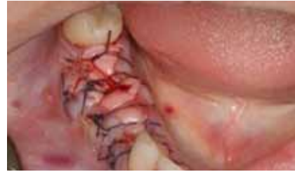
Fig. 2: Initial treatment

the palm of the hand. Both are skin, but which one is tougher? Obviously, the palm is.