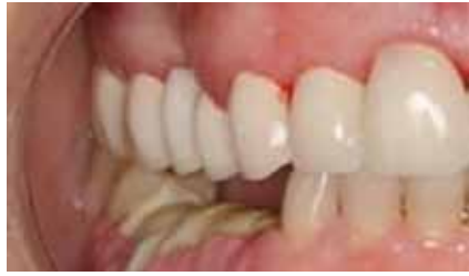
Fig. 4: Two weeks post-op. Sutures removed.