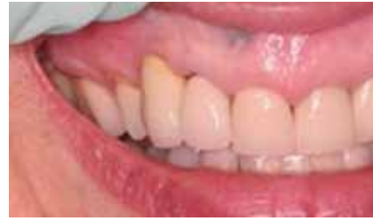
Fig. 6: Twelve weeks post-op.