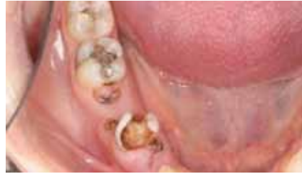
Fig. 1: Initial treatment

Well, it has happened to all of us at one time or another. The perfect analogy to use and consider, especially when speaking to patients, is the outer surface of the hand versus