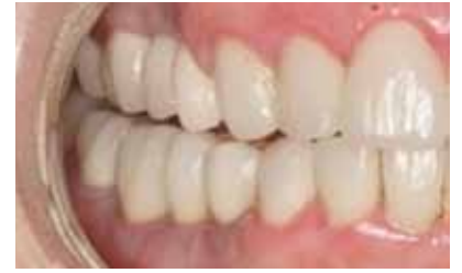
Fig. 7: Final case restored.