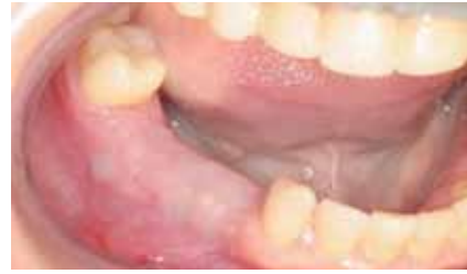
Fig. 5: Six weeks post-op.