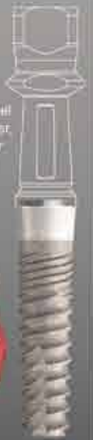
2-Piece Tissue-Level Implant with Transfer, Abutment & Collar Included: $200