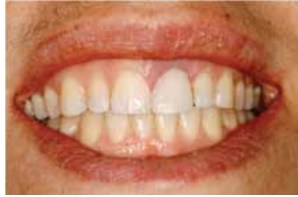
Fig. 2: Immediate temporary placement.

The Atlantis Abutment was tried in (Fig. 3). Note the excellent tissue