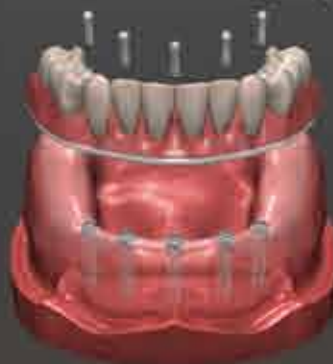
1-Piece Implant with Screw Receiving Platform: $150