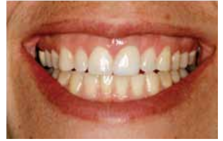
Fig. 4: Final crown restoration.

Figure 4 exhibits the completed restoration. Careful observation reveals an intact papilla, correct anatomic contours of the abutment, healthy and firm gingival tissues and an excellent shade, contour and glaze effect that blends with the natural dentition.