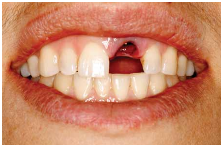
Fig. 1: Immediate implant placement.

The temporary crown was taken out of occlusion and the interproximal contacts were slightly opened. The crown was carefully polished so that no tissue irritation would occur (Fig. 2). This photo was taken immediately after the surgery and