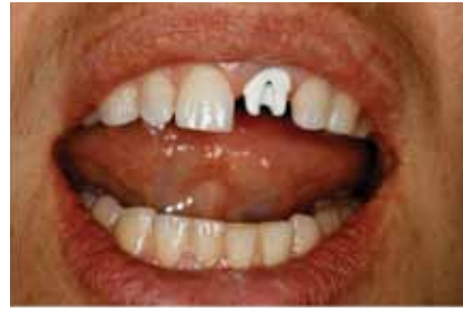
Fig. 3: Custom abutment placement.

The crown was then placed and custom shaded. On most anterior cases, custom shading by painting the desired porcelain shades on the crown in the mouth and then re-firing the crown allows for subtle changes that can truly enhance the