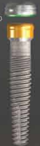
1-Piece Implant: $150