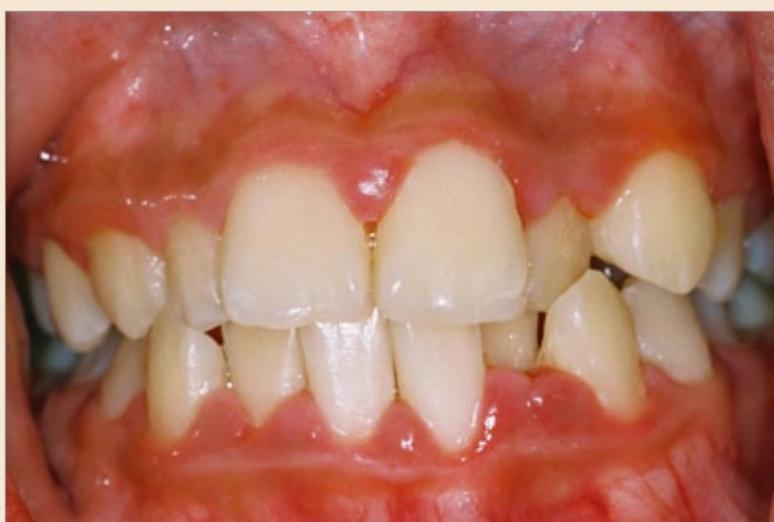
Poor dental hygiene can provide bacteria with a route into the bloodstream according to this latest research by the University of Bristol and RCSI in Dublin

In their study, Jenkinson and colleagues found that once Streptococcus bacteria get into the bloodstream, they use a protein called PadA which sits on their outer surface, to hijack blood platelets and force them to clump together and make blood clots.