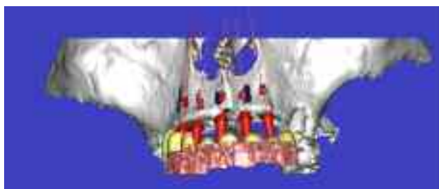
Fig. 6: SimPlant software.