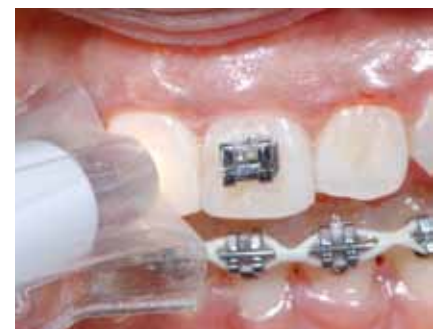
Fig. 11: Color matching using the VITA Easy Shade spectrophotometer.