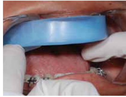
Fig. 4: Tres White Ortho tray in the upper maxillary.