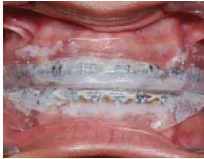
Fig. 6: Upper and lower bleaching trays in position with hydrogen peroxide in close contact to the teeth.