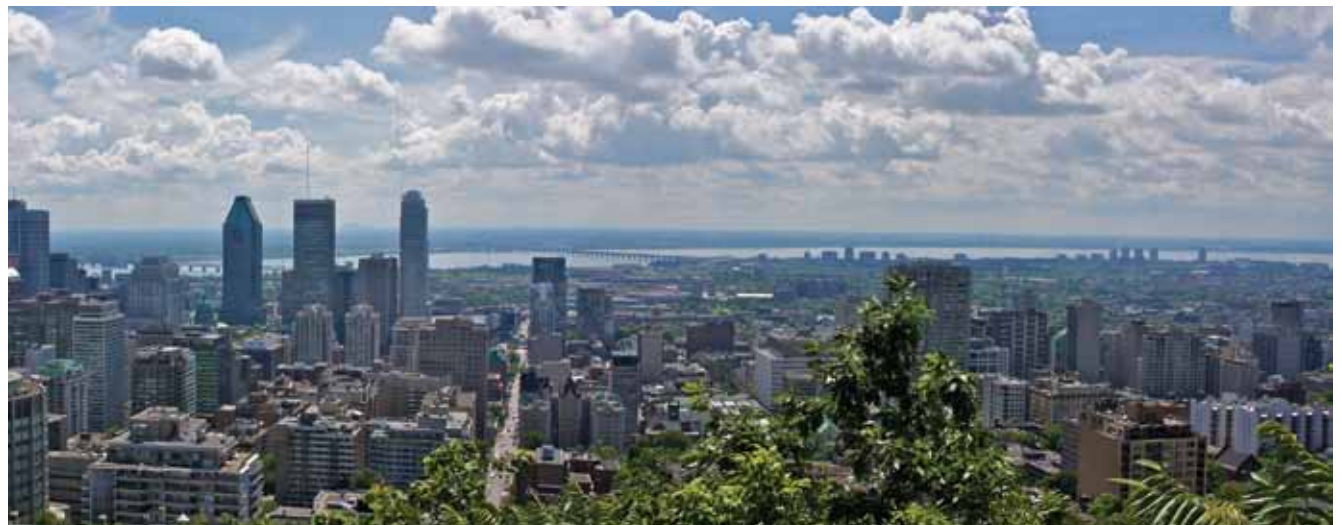
A view of downtown Montreal.

The Northeastern Society of Orthodontists (NESO) is going international for this year's 89th annual meeting. The four-day event, to be held from Nov. 11–14, is taking place at the Hilton Bonaventure in Montreal. So grab your passport and start making plans if you haven't already.