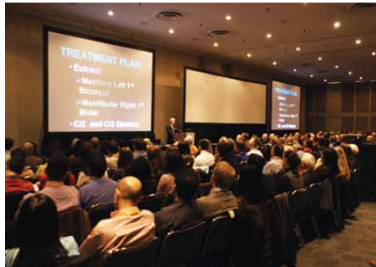
A scene from last year's orthodontic specialty program during the Greater New York Dental Meeting.