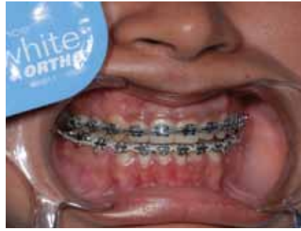
Fig. 3: Tres White Ortho ready to be used.