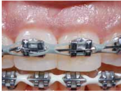
Fig. 2: Close up of patient under orthodontic treatment.