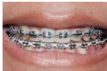
Fig. 1: Patient under orthodontic treatment.

The result is a whitening technique that also achieves a marked