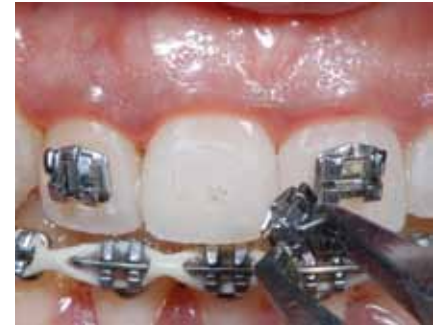
Fig. 9: Notice teeth color where the bracket was after first bracket is removed.