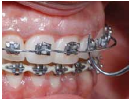
Fig. 7: After 10 days of whitening treatment, we start the removal of orthodontic devices.