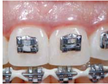
Fig. 8: With the wires off, the brackets themselves are now ready to be removed.