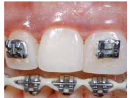
Fig. 10: Regular color under bracket; no color differences were found.