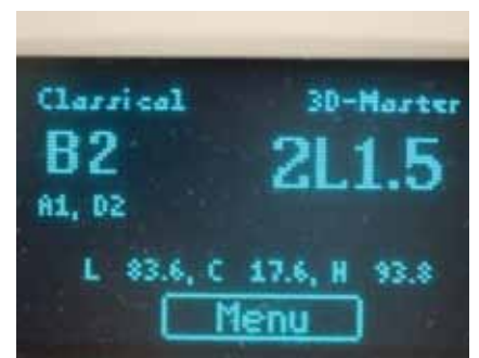
Fig. 12: Color matched, B2, showing in the Easy Shade screen.