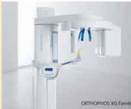
ORTHOPHOS XG Family