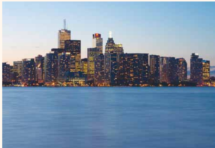
North America's biggest single-day dental convention, the Toronto Academy of Dentistry Winter Clinic, celebrates 75 years on Friday, Nov. 2.