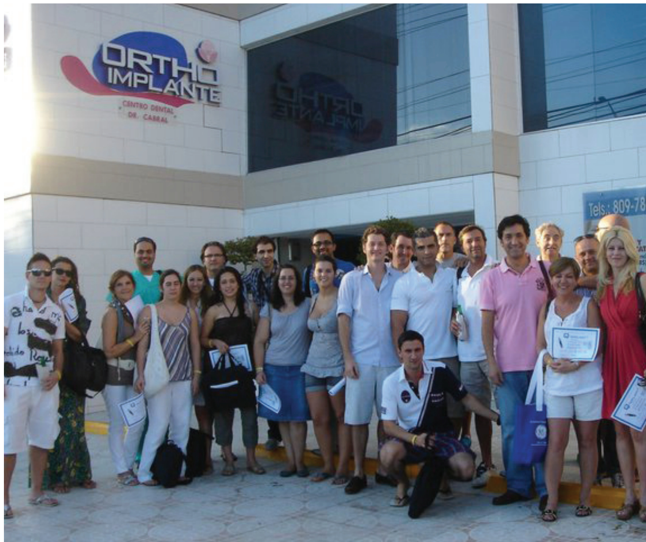
The Q-Implant Marathon team with participants in Santo Domingo.

This gives dental practitioners an opportunity to learn the relevant practical