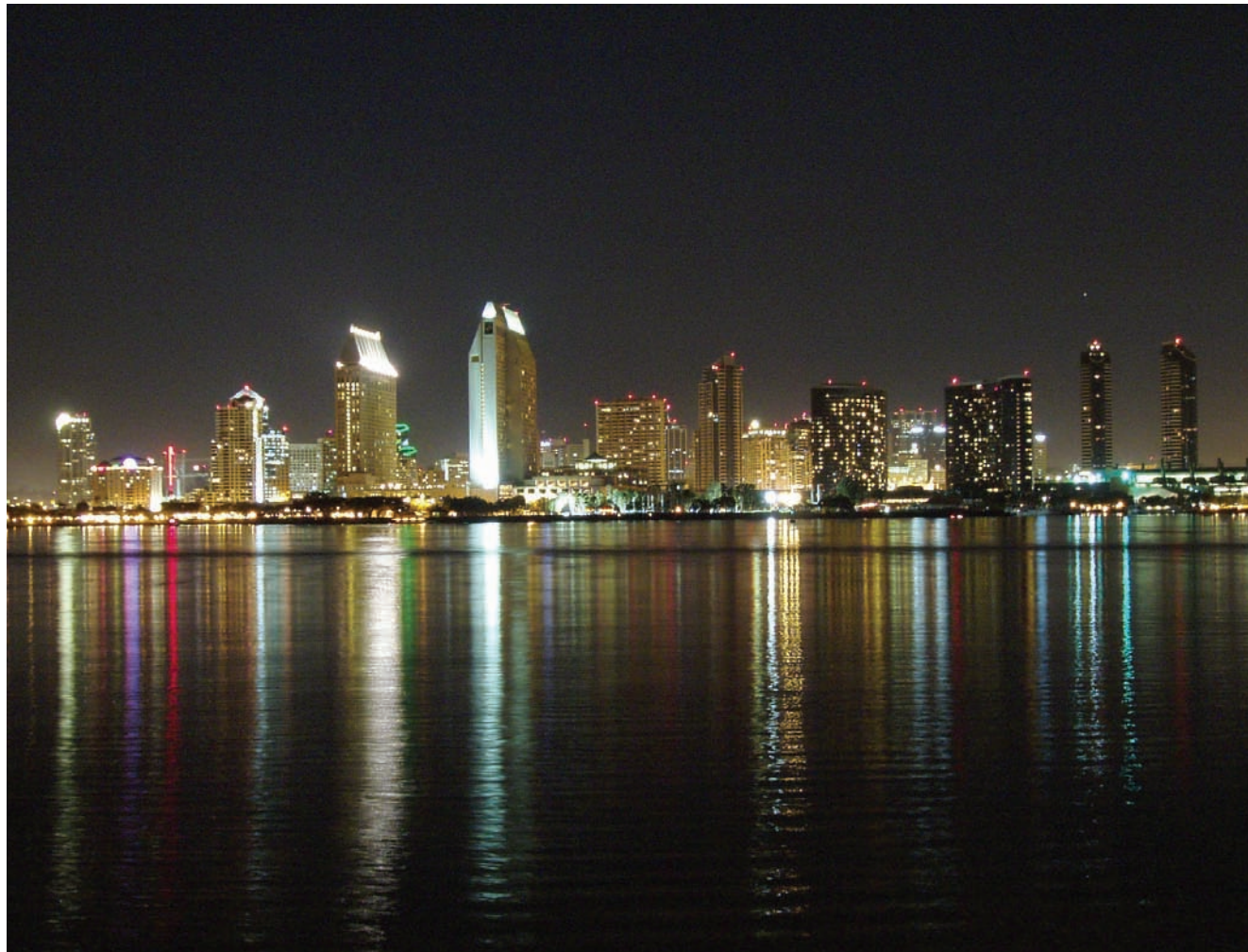
The International Congress of Oral Implantologists is hosting its annual Winter Symposium from Feb. 16–18 in San Diego.