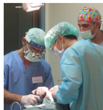
Q-Implant Marathon participants in Santo Domingo working in a team.

The atmosphere is harmonious: even after 12 hours in the surgery room, the groups still like to meet for an evening meal. Cour-