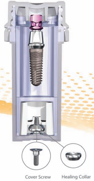
Cover Screw Healing Collar