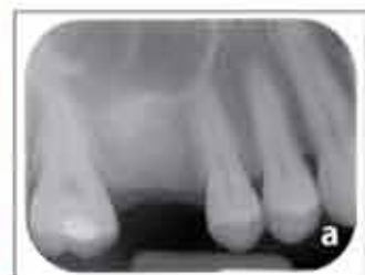
16 Week X-Ray Ideal Bone Formation