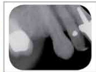
16 Week X-Ray Ideal Bone Formation