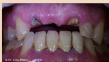
Direct clinical view of fractured teeth 12 and 21 (including adhesive posts).

X-ray diagnosis proved vertical root fracture of both teeth. Poor prognosis led to immediate extraction recommendation, to avoid further infection (leakage) and optional bone loss.