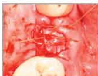
Sutured Without Primary Closure