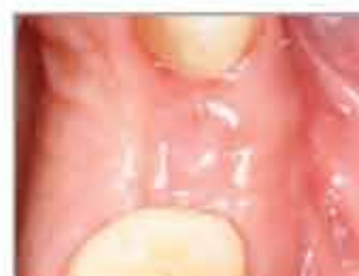
4 Week Post-Op Mature Tissue Closure