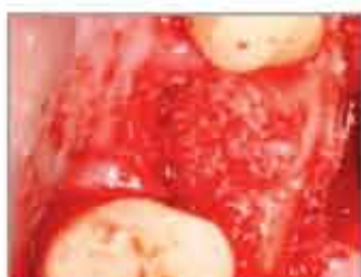
Grafted Extraction Socket