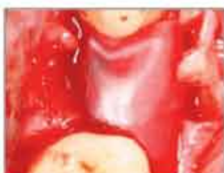
Renovix ® Draped Over Surgical Site