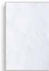
20mm x 30mm

Extra 5mm Length Allows Buccal-Lingual Coverage