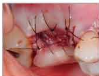
Sutured Without Primary Closure