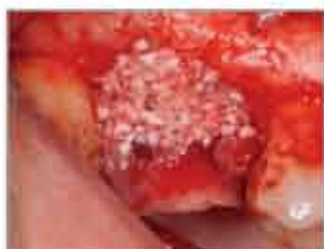
Grafted Extraction Socket