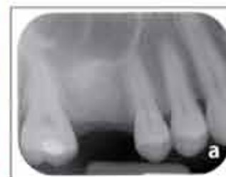
16 Week X-Ray Ideal Bone Formation