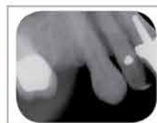
16 Week X-Ray Ideal Bone Formation