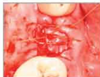
Sutured Without Primary Closure