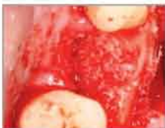
Grafted Extraction Socket