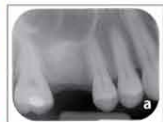
16 Week X-Ray Ideal Bone Formation