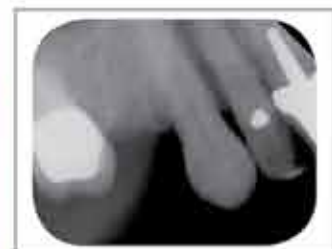
16 Week X-Ray Ideal Bone Formation