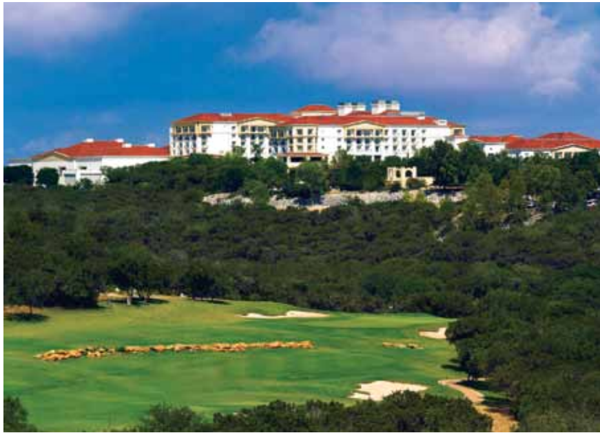
Osteogenics Biomedical's annual Global Bone Grafting Symposium will be held at The Westin La Cantera Resort in San Antonio, Texas.