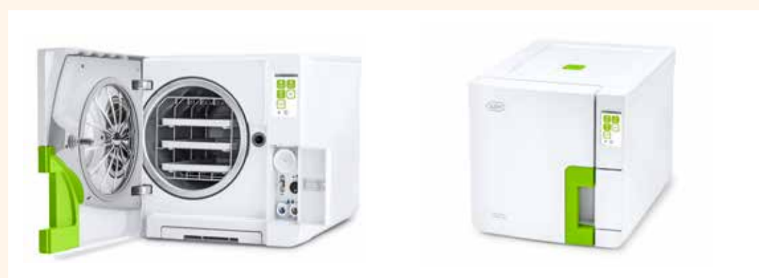
The type B sterilizer Lara: perfect ergonomics and functionality for incredible usability.

For further information, please contact: