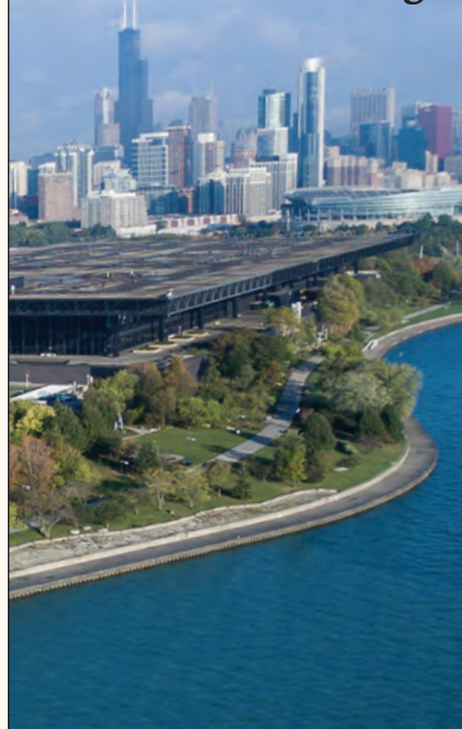
Chicago's McCormick Place Lakeside Center is the host site of the 2018 American Academy of Cosmetic Dentistry annual meeting.