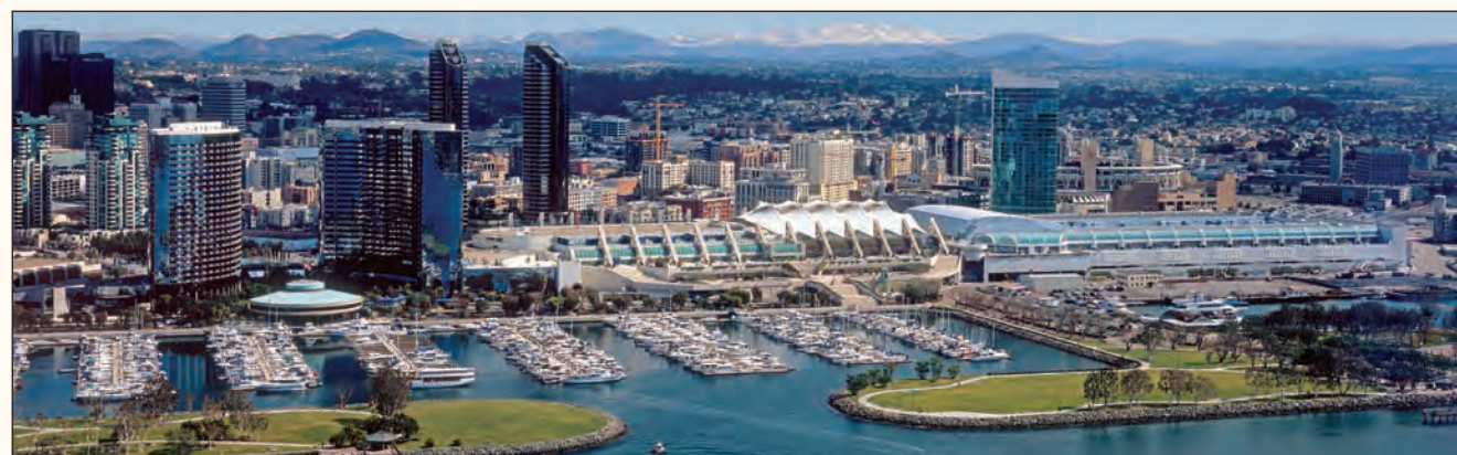
The San Diego Convention Center, on the city's waterfront and a short stroll away from the city's popular Gaslamp Quarter, is host site of the American Academy of Cosmetic Dentistry 2019 annual scientific session, April 24–27.