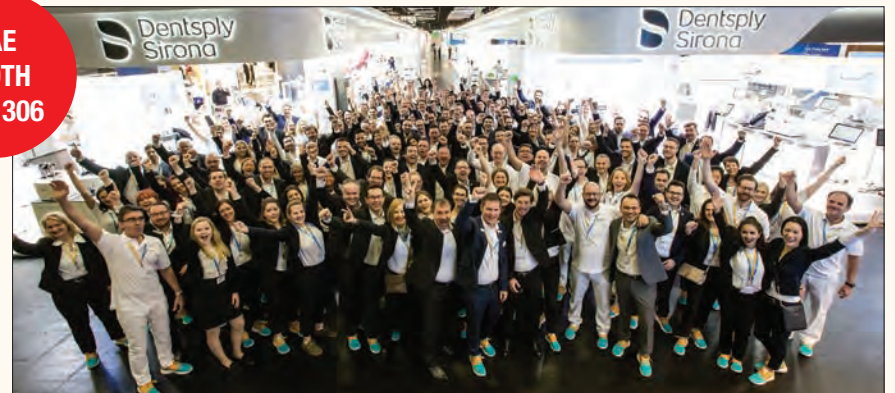
The Dentsply Sirona team at IDS 2019.

level of interest. The self-adhesive restoration material combines the simplicity of a glass ionomer with the stability of a conventional composite and has good esthetic properties. This allows a cavity to be treated in just one layer without retentive preparation, making the entire treatment process four steps shorter (and about seven minutes quicker).