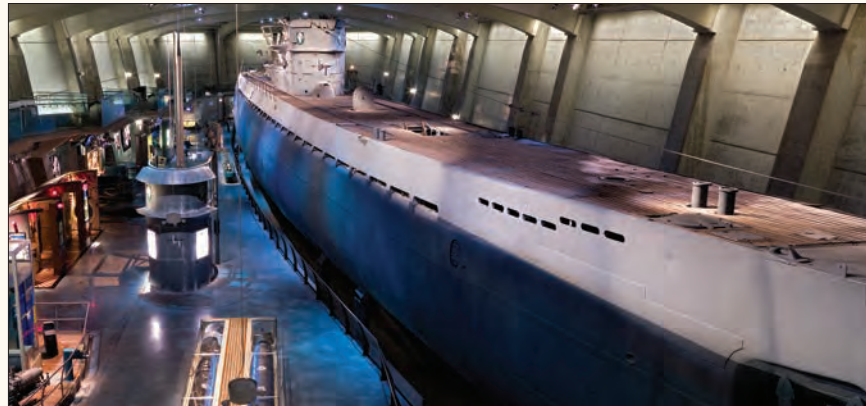
The AAPD 2019 Welcome Reception at Chicago's famed Museum of Science and Industry will feature emersive exhibits open to attendees, including the chance to tour a German U-505 submarine captured during World War II.