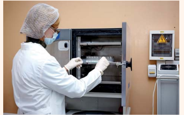
Surgical osteoplastic materials section