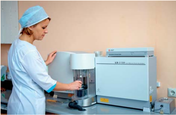
Medical and technical systems department