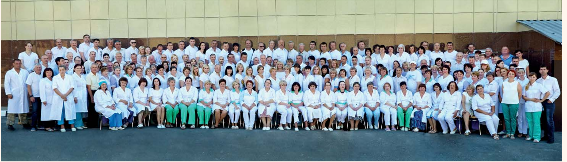
Employees of VLADMIVA company

VladMiVa, a large Russian holding company that unites a number of Belgorod-based companies and is invested in the development and manufacturing of materials, tools and equipment for dentistry, celebrated its 25 th anniversary in 2017.