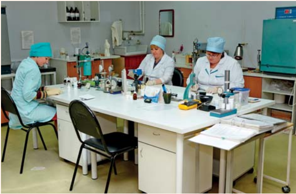
Technical Control Department