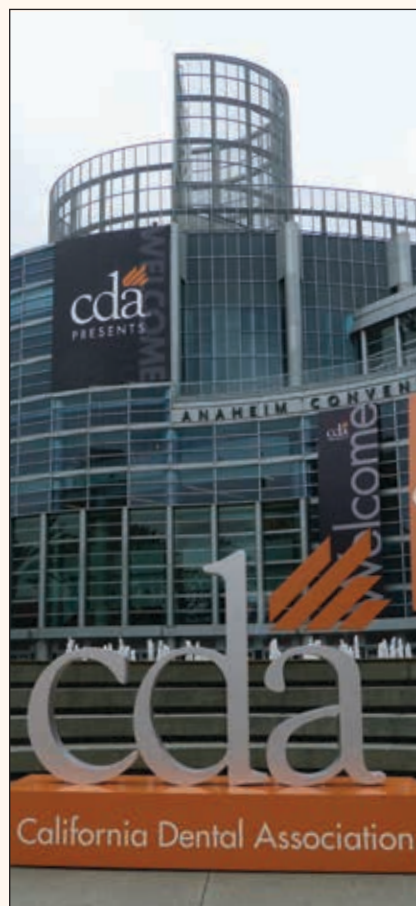
The Anaheim Convention Center is the host site of CDA Presents The Art and Science of Dentistry, May 16–18, in Anaheim, Calif.