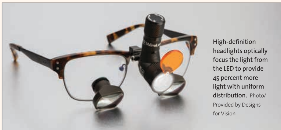
High-definition headlamps optically focus the light from the LED to provide 45 percent more light with uniform distribution.

Designs for Vision is also excited to announce that it have recently expanded into its new 67,500-square-foot location