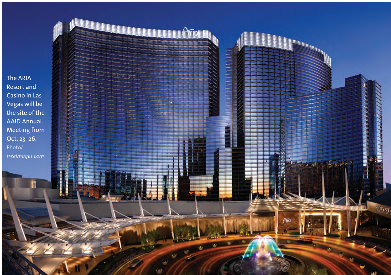
The ARIA Resort and Casino in Las Vegas will be the site of the AAID Annual Meeting from Oct. 23-26.

68th AAID Annual Meeting aims to offer quality C.E., fresh perspectives and time to network