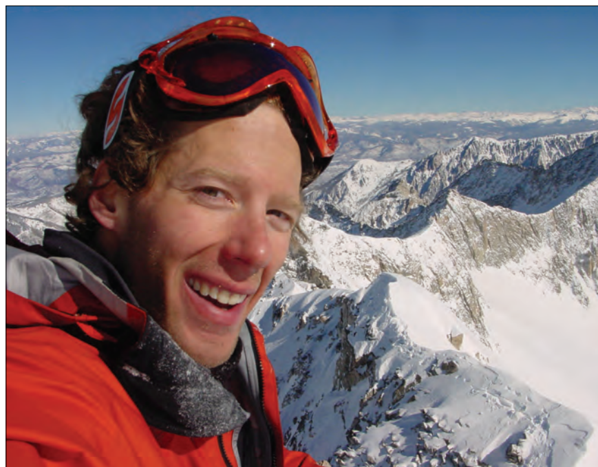
Self-portrait of American mountaineer Aron Ralston on the 14,137-foot-high summit of Capitol Peak, in Pitkin County, Colo., on Feb. 7, 2003. Ralston will speak at the AAE's General Session, taking place Wednesday, April 25 during AAE18.