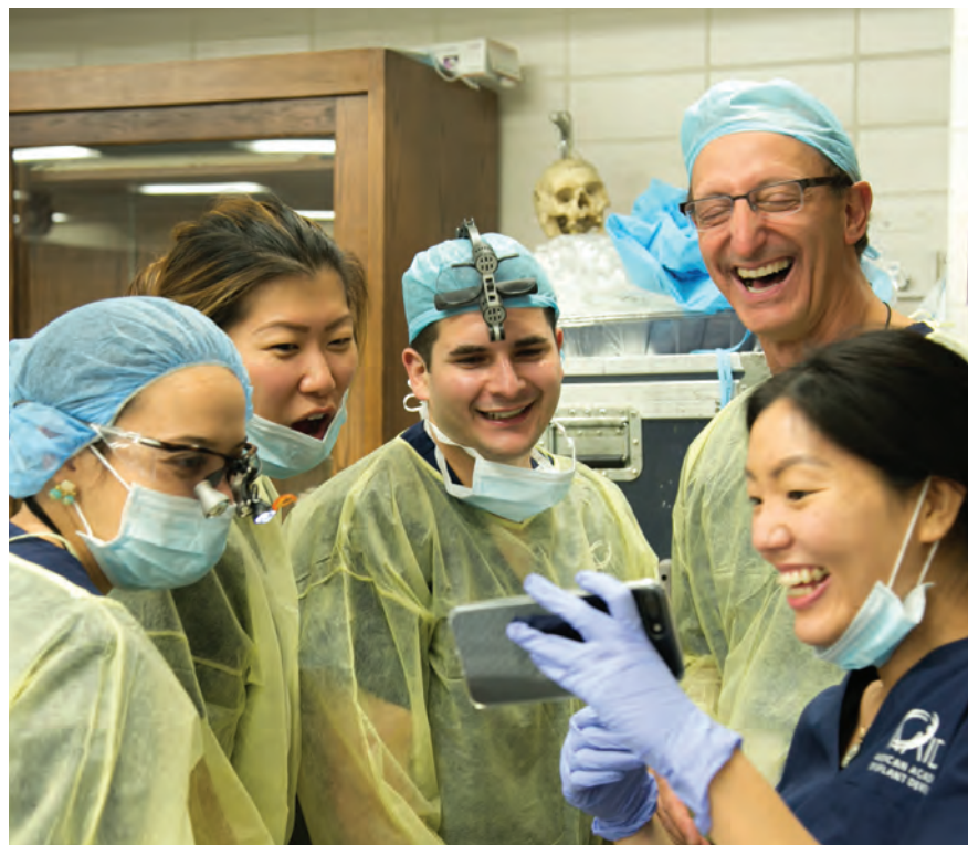
Dental implant teams are encouraged to attend the AAID annual conference together.

When you're not attending sessions, there are plenty of sights to see in Dallas, such as the Reunion Tower, Dealey Plaza and the West End. Add the Texas State Fair to your list of places to visit! It is an amazing experience, AAID staff asserts.