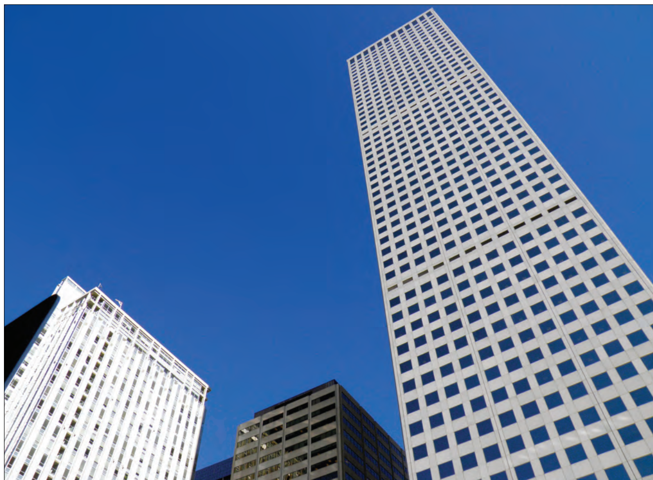
AAE's 2018 annual meeting, taking place in Denver, promises to be the most comprehensive endodontic education summit, vendor exhibition and networking opportunity in the world.

Attendees also will be able to visit with more than 100 vendors in the AAE18 exhibit hall to explore the latest in end-