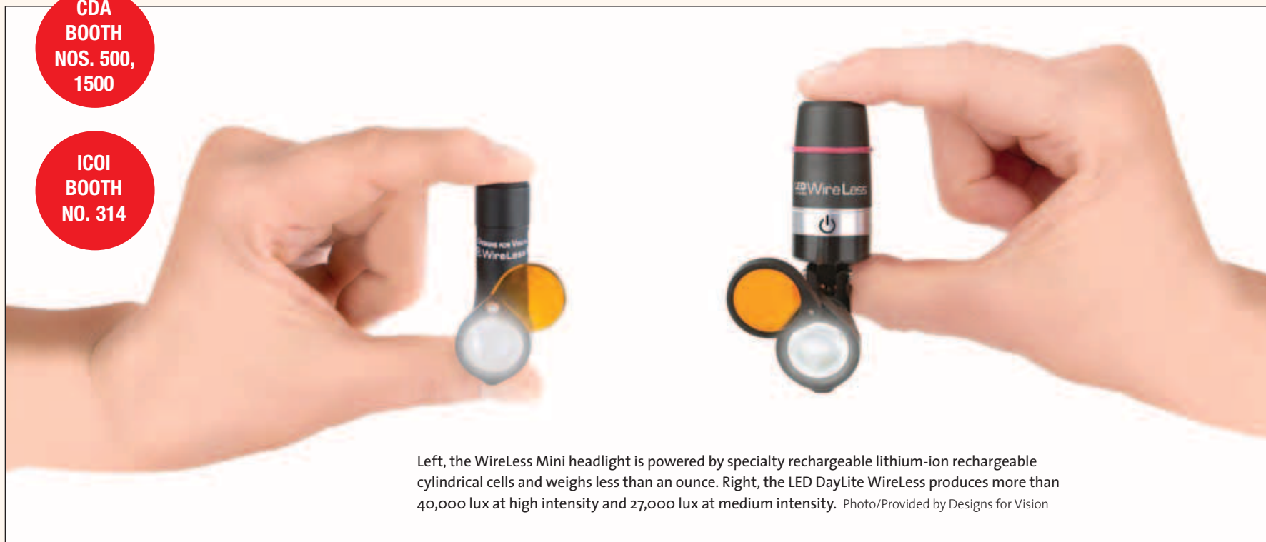
Left, the WireLess Mini headlight is powered by specialty rechargeable lithium-ion rechargeable cylindrical cells and weighs less than an ounce. Right, the LED DayLite WireLess produces more than 40,000 lux at high intensity and 27,000 lux at medium intensity.