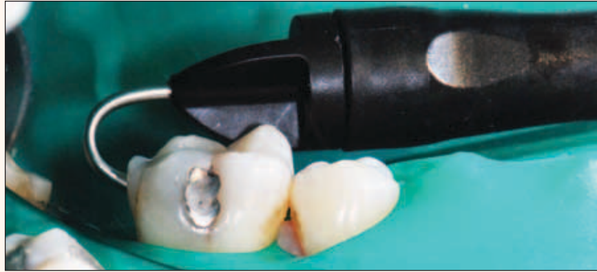
The metal cannula on the Luer Lock tip is 360-degree rotatable and can be bent up to 180 degrees without reducing the inner diameter and material flow.

The metal cannula is rounded by a vibratory finishing process. Because of this special surface treatment, the metal is