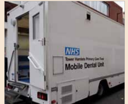
The mobile dental unit for homeless people outside the Whitechapel Mission