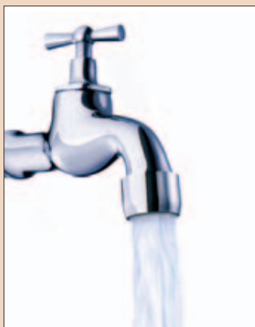
Hampshire councillors are fighting fluoridation

Southampton City councillors are backing an NHS proposal to fluoridate water in the area but Hampshire councillors are vehemently opposing it.