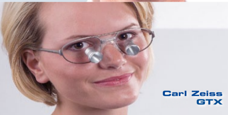
Carl Zeiss GTX