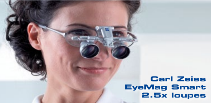
Carl Zeiss EyeMag Smart 2.5x loupes