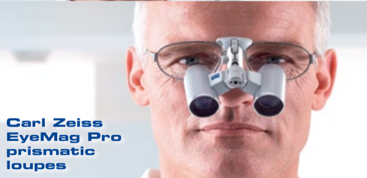
Carl Zeiss EyeMag Pro prismatic loupes