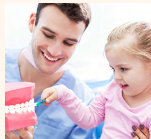
In a recent submission, the Child Poverty Action Group has recommended taking immediate steps to achieve free dental care and healthcare for all young people under 18 years.