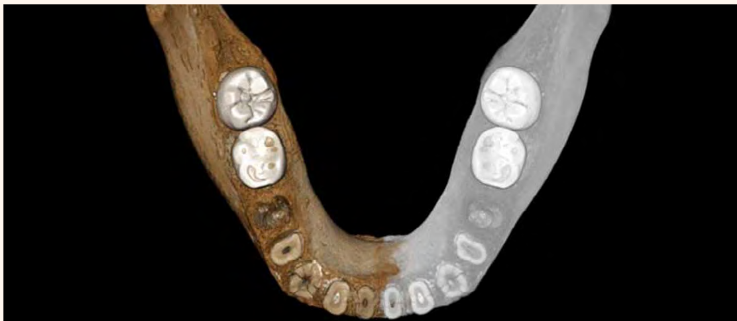
Virtual reconstruction of the Xiahe mandible, after digital removal of the adhering carbonate crust. The mandible is so well preserved that it allows for a virtual reconstruction of the two sides of the mandible.