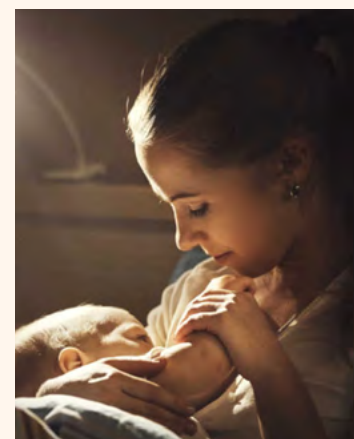
A new study has reported dental and general health benefits of breastfeeding and water fluoridation.

in 2010, 55 per cent of 6-year-olds had experienced dental caries in their primary teeth. The new research looked at dental caries in 5- and 6-year-olds in Australia and examined whether they had been exposed to fluoridated water or breastfed as infants and for what duration. The study used data collected in one of the largest and most comprehensive population-based studies of child oral health in Australia, the National Child Oral Health Study 2012-14.