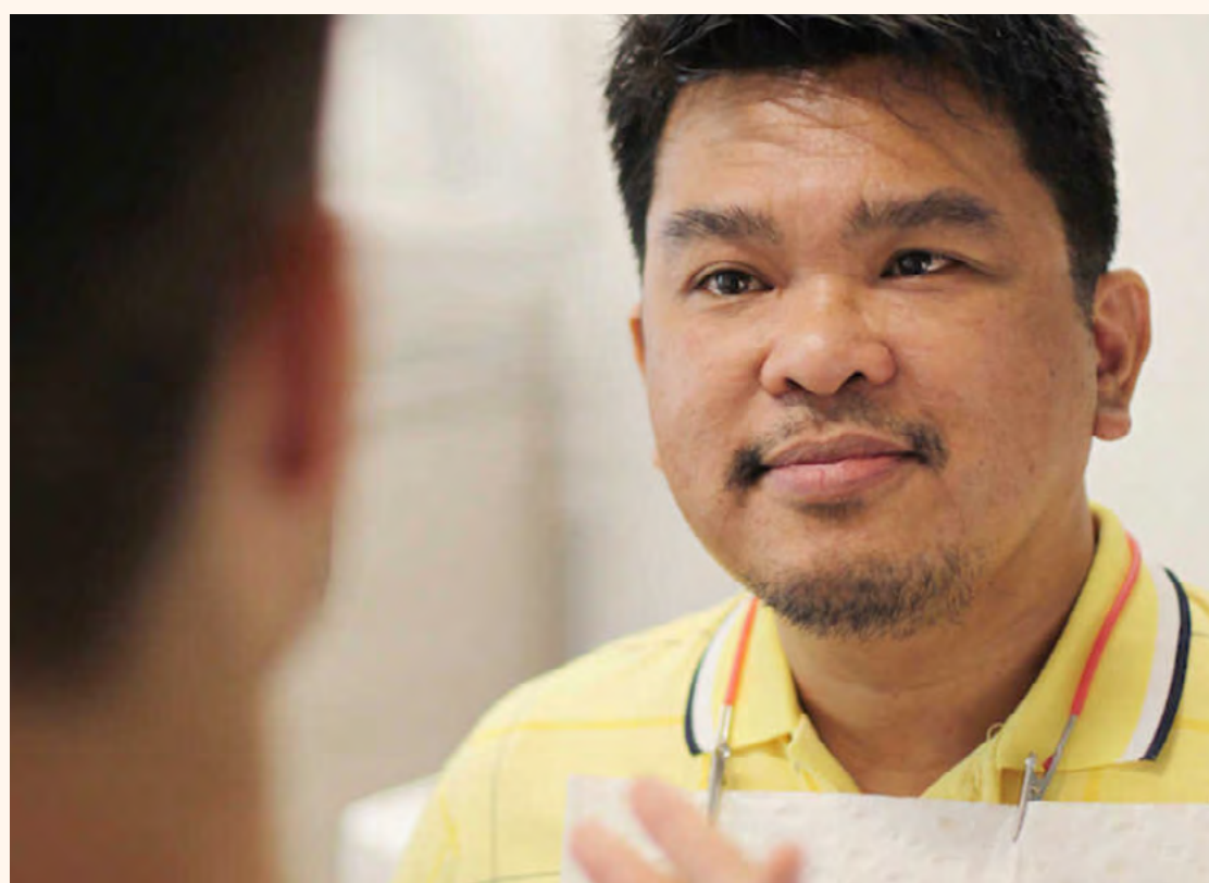
Eating disorders are serious mental health conditions which have a significant and underestimated impact on Australian society.

It is the goal of the NEDC to work collaboratively across the sector to provide better outcomes for all Australians living with an eating disorder, through the sharing and development of evidence-based, nationally consistent information and standards.