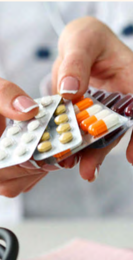
A recent study has found that the prophylactic use of antibiotics has no influence on the prevalence of post-surgical dental implant complications in overall healthy patients.

meta-analysis," was published in the April 2019 issue of Clinical Oral Investigations .