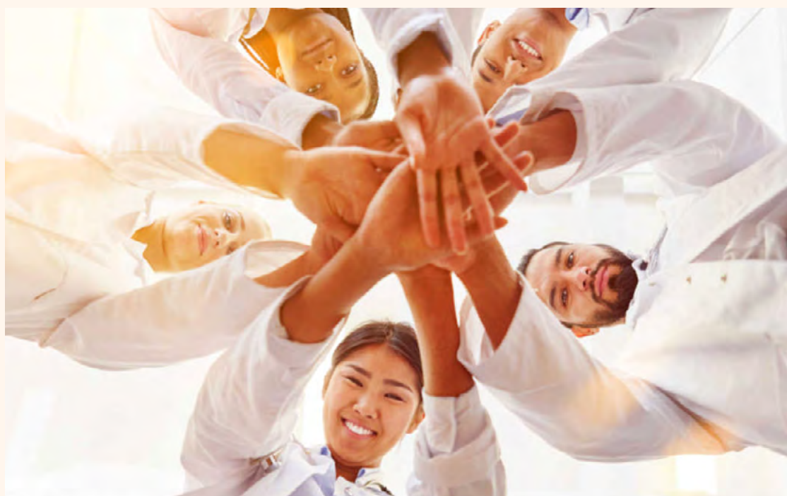
The Australian Dental Association has expressed its commitment to its continued work with the newly re-elected coalition to achieve affordable dental healthcare.

The ADA has long lobbied successive federal governments to address the urgent and growing need for additional, targeted and sustainable funding to meet the requirements of disadvantaged Australians, and it will continue its push for affordable oral healthcare with the re-elected coalition government.