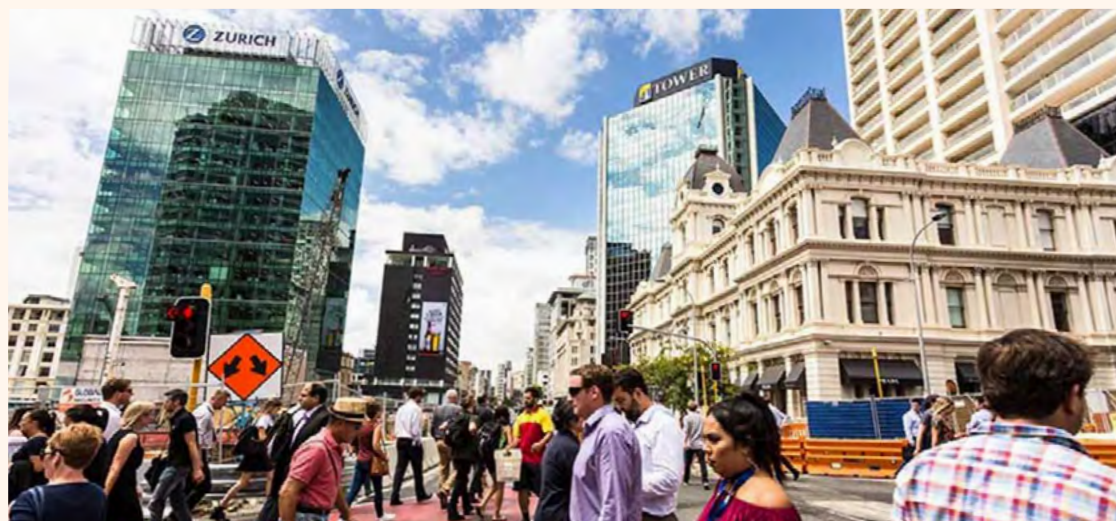
In a new study, researchers have gone straight to the source to find out why adolescents from the Pacific Islands living in New Zealand are less likely to visit the dentist than their peers of other ethnicities.

The study, titled "Pasifika adolescents' recommendations for increasing access to oral health care", was published in the March 2019 issue of the New Zealand Dental Journal.