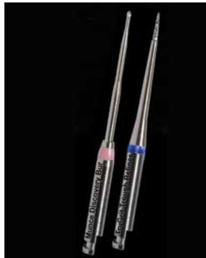
The TruGritTroughRefiner.

With its slow rotation, the TruGrit Trough Refiner offers increased opera-