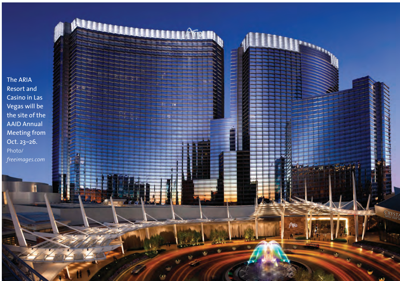
The ARIA Resort and Casino in Las Vegas will be the site of the AAID Annual Meeting from Oct. 23-26.

68th AAID Annual Meeting aims to offer quality C.E., fresh perspectives and time to network