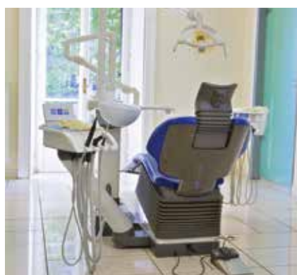
A new program will aid endodontists in providing free access to care to underserved patients.