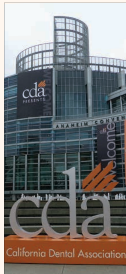
The Anaheim Convention Center is the host site of CDA Presents The Art and Science of Dentistry, May 16–18, in Anaheim, Calif.