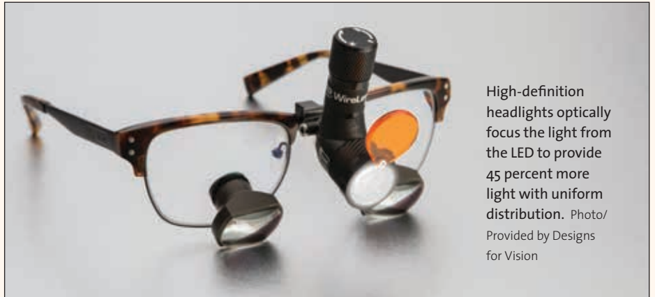
High-definition headlamps optically focus the light from the LED to provide 45 percent more light with uniform distribution.

The LED DayLite Micro HDi uses the new high-definition imaging with a very lightweight headlamp in combination with the Micro power pack. The Micro power pack is the lightest and smallest power pack. The complete unit includes two power packs, and each power pack