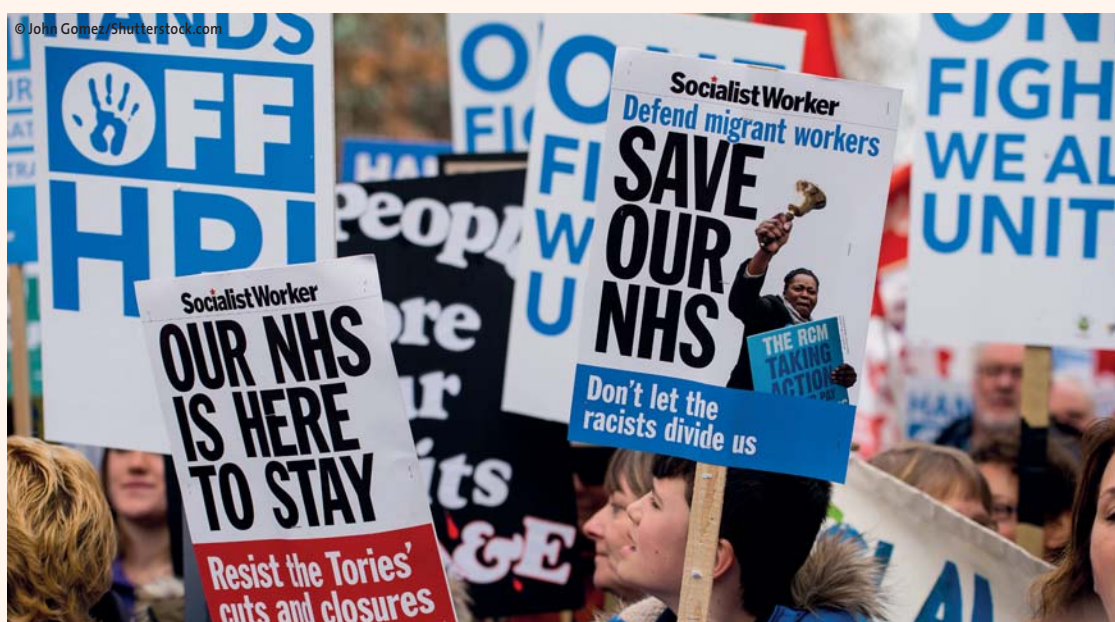
Demonstrations against NHS cuts in London.

The worrying figures come after statistics from NHS Digital