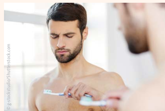
One in three men only brush their teeth once a day.

LONDON, UK: Only two-thirds of British people brush their teeth the recommended two times a day, a new survey has found. The remaining third only use their toothbrush once a day and primarily in the morning,