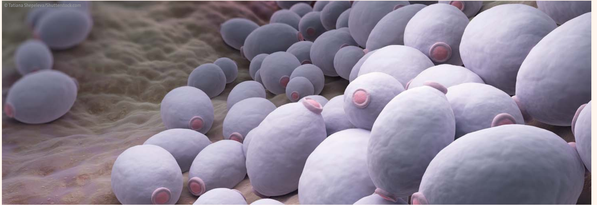
Candida albicans is a causal agent of opportunistic oral and genital infections in humans.

pain that makes it difficult for patients to eat or swallow. It is also believed to be responsible for other serious fungal infections, especially in infants and other patients with a compromised immune system