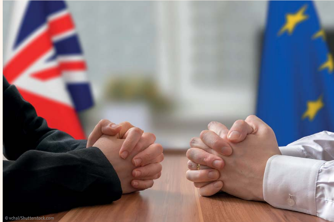
Negotiations between the UK and the EU have stalled recently.

Among other points, both organisations have recommended that an agreement should include the UK’s adoption of EU medical device regulations and the country remaining an active participant