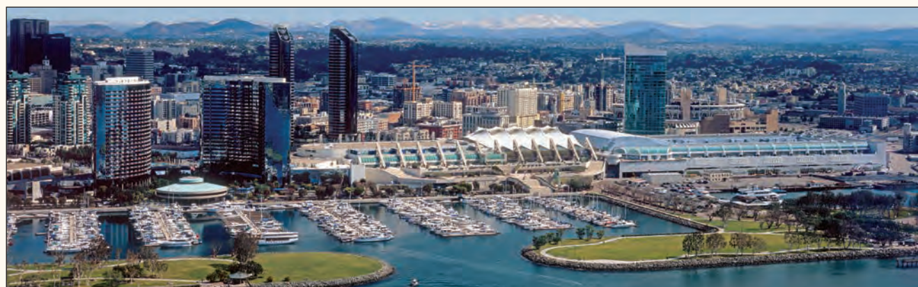
The San Diego Convention Center, on the city's waterfront and a short stroll away from the city's popular Gaslamp Quarter, is host site of the American Academy of Cosmetic Dentistry 2019 annual scientific session, April 24–27.