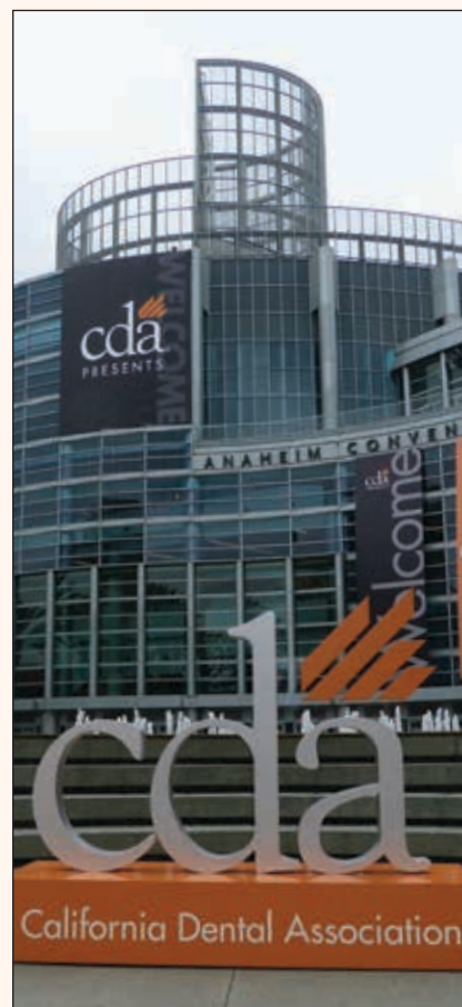
The Anaheim Convention Center is the host site of CDA Presents The Art and Science of Dentistry, May 16–18, in Anaheim, Calif.