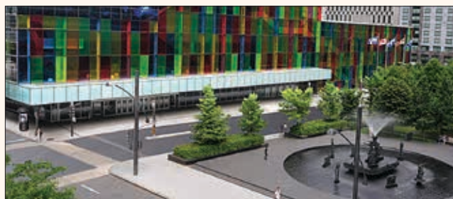
The fountain of Place Jean Paul Riopelle, across the street from the multicolor glass walls of the Palais des Congrès de Montréal.

The C.E. courses feature theoretical and practical training presented by renowned