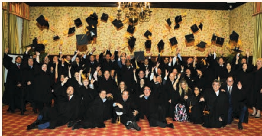
New IADFE fellowship inductees toss mortar boards into the air at the 2018 IADFE meeting. The 2019 induction is once again being held in conjunction with the Greater New York Dental Meeting, on Monday, Dec. 2.

This year's annual induction meeting will be once again in conjunction with the Greater New York Dental Meeting, on Monday, Dec. 2. The guest presenter will be American Dental Association President