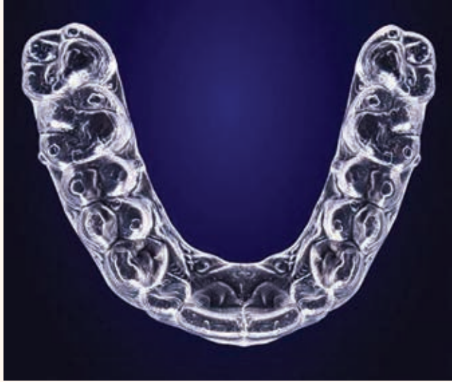
According to Allure Ortho, the company's TAGLUS aligner/retainer material has high polishability, no moisture sensitivity and no bubbling.