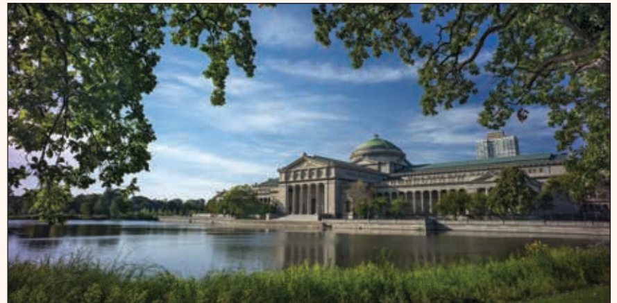
Museum of Science and Industry, Chicago building (south view) is hosting the Sunstar Welcome Reception at AAPD19.

The Sunstar Welcome Reception will be held at the Museum of Science and Industry, in Chicago's historic Hyde Park neighborhood. Attendees will be able to meet