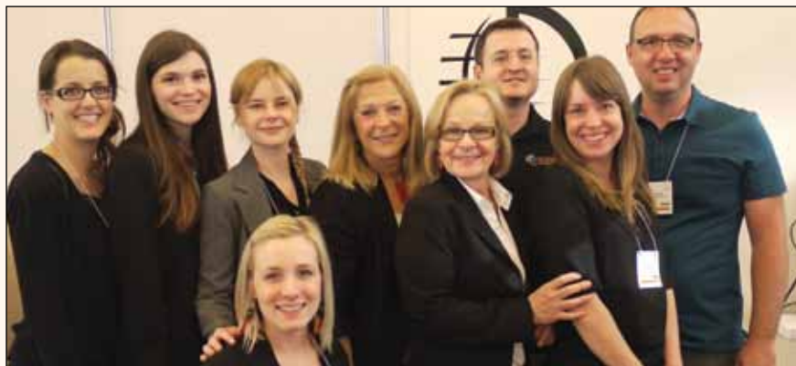
The JDIQ registration staff, pictured here at the 2013 meeting, is always ready to help. The 2014 JDIQ runs from May 23–27.