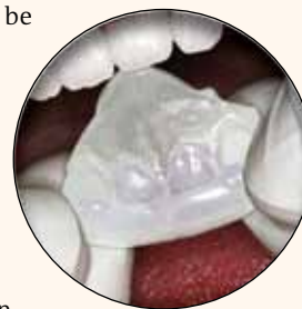
Keystone Industries describes its new anti-bruxism device, NiteBite, as a preventive and occlusal treatment that is easy to use and cost effective.

With its simple design and easy application, NiteBite enables dentists to help the millions of untreated bruxing patients across the country.