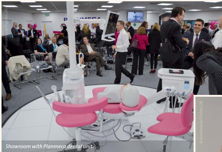
Showroom with Planmeca dental unit.

"This is a new era for Planmeca UK and our new home is one of the most important foundations from