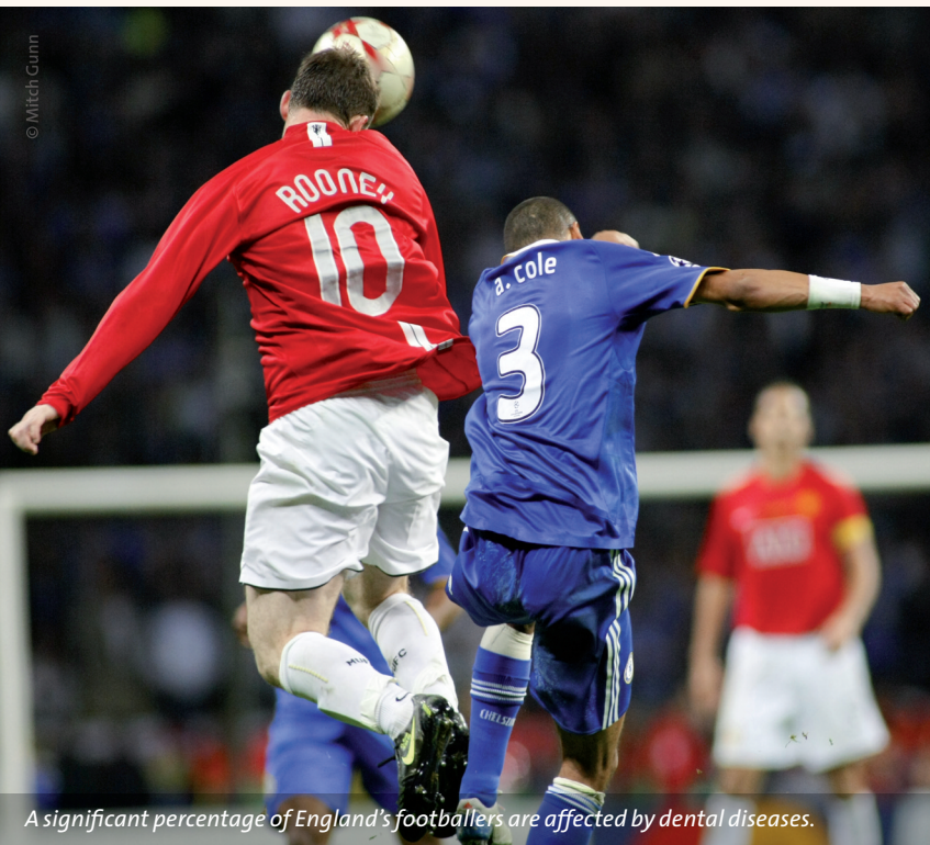
A significant percentage of England's footballers are affected by dental diseases.