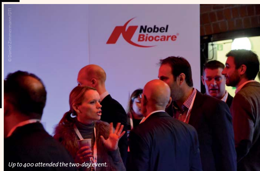
Up to 400 attended the two-day event.