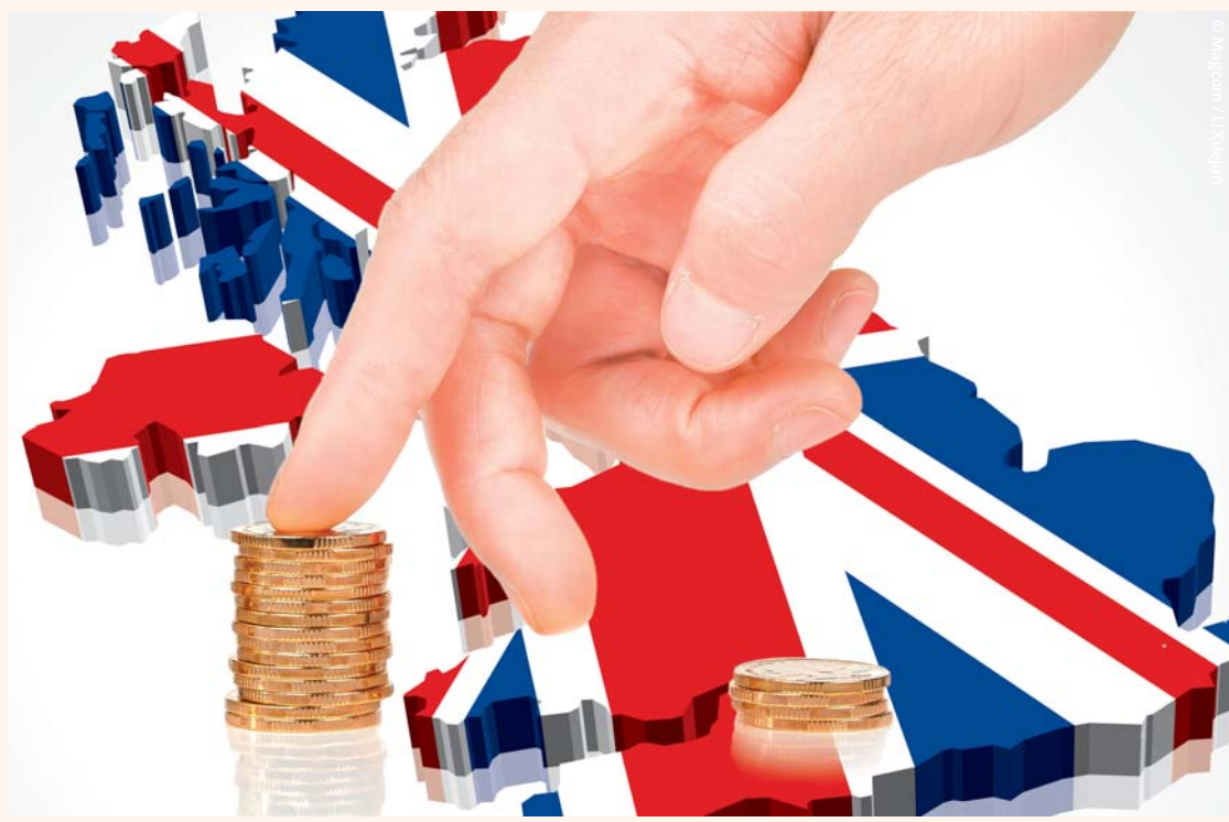
Patients in some parts of the UK have to pay up to twice as much than do patients in the rest of the country.

The national average for a dental check-up is £46, according to Whatclinic.com . However, over 80 per cent of all of the cities and towns surveyed charge less than that, the results indicate.