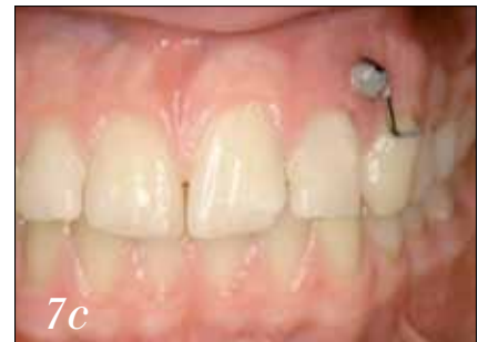
Figs. 7a–c: Extrusion of a single tooth. Viable lateral incisor following intrusion due to trauma (a). Miniscrew with indirect anchoring of the canine and straight arch technique, in order to extrude tooth #22 (b). Status after three months (c).