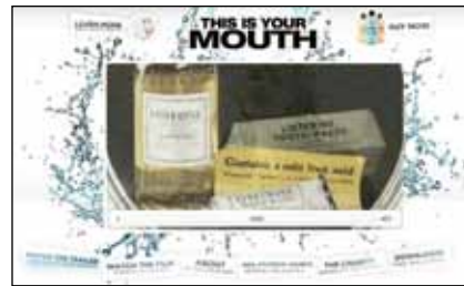
A screenshot of www.listerine.com/yourmouth .

Each time the documentary is viewed, a $1 donation will go from Johnson & Johnson to the National Children’s Oral Health Foundation: America’s Toothfairy.