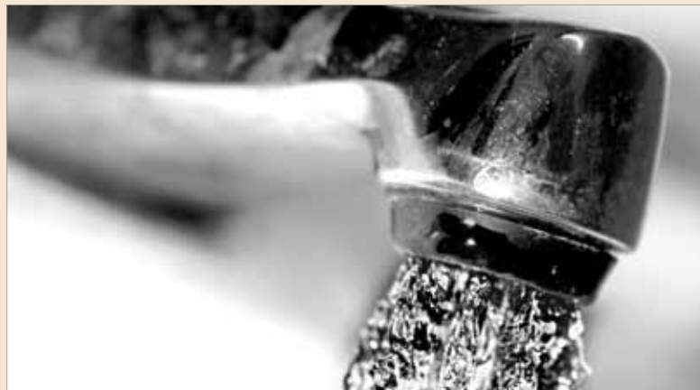
The SCSHA has illegally forced the fluoridation of Southampton's water

Southampton's water, the High Court has heard. The SCSHA has illegally forced the fluoridation of Southampton's water