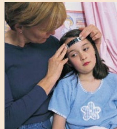
Patients are missing out on care

the BDA research suggest that the problem is more prevalent among new patients than those who have been visiting a practice for many years. They also suggest that the problem has become more acute since dental practices' ability to charge patients for missed appointments was abolished in 2006.