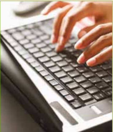
Online training is the future