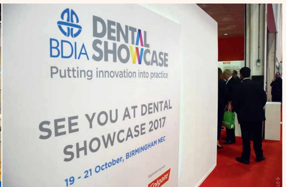
Announcement for BDIA Dental Showcase 2017