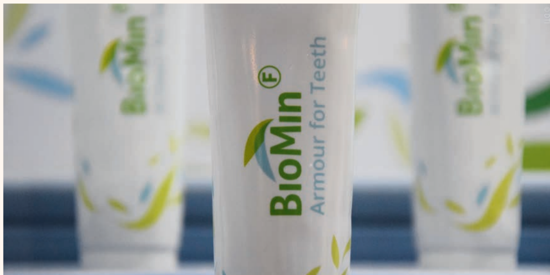
Toothpaste with bioactive glass has been available on the market since May this year.

"Research in the US suggests this will potentially prolong the life of fillings and slow secondary tooth decay because the depth of