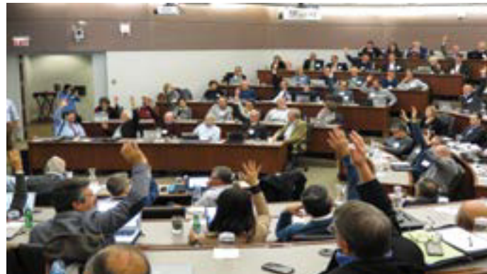
The World Workshop on the Classification of Periodontal and Peri-Implant Diseases and Conditions took place Nov. 9-11 in Chicago.

Participants conducted literature reviews, established case definitions and deliberated diagnostic considerations for the following topic areas: periodontal health and gingival diseases and conditions; periodontitis; developmental and acquired conditions and periodontal manifestations of systemic conditions; and peri-implant diseases and conditions. The inclusion of peri-implant diseases and conditions within periodontal