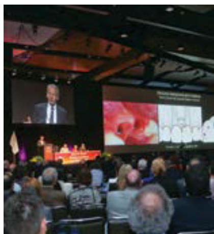
Attendees take part in an educational session at the 2017 AO Annual Meeting.