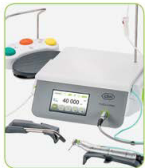
NEW Implantmed SI-1015 with wireless foot pedal option, Osstell ISQ option and LED powered motor option

Please visit us at the AAOMS in booth # 1310 to experience the latest in W&H surgical products! You can also go to www.wh.com/na for more information