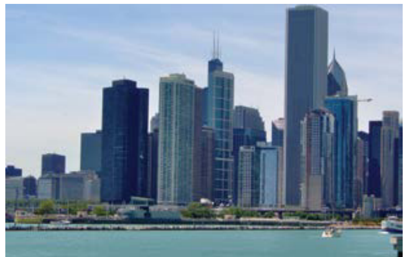
Chicago will be the site of the 25th AAOMS Dental Implant Conference from Nov. 30 to Dec. 2.