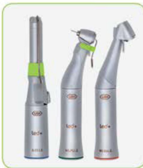
Surgical straight and contra-angle handpieces with or without Mini LED+