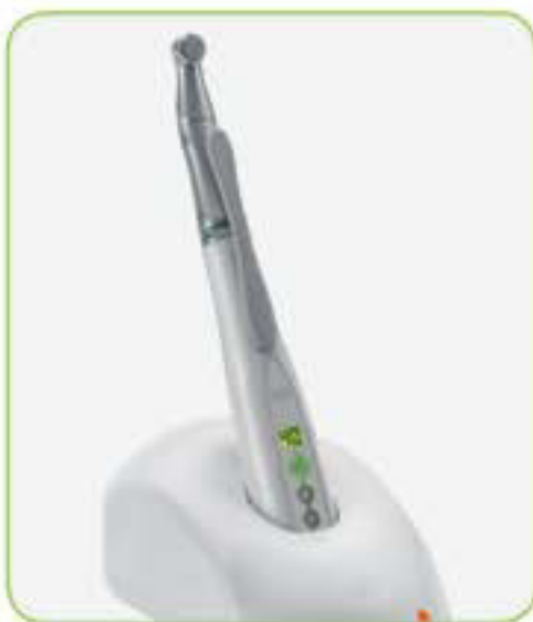
IA-400 Digital torque wrench